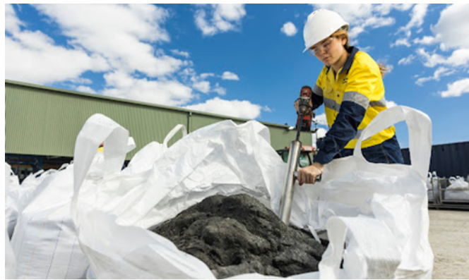
Fig.2 - Mt Carbine concentrate, sampling process (concentrate shipped with 50-55% WO 3 grade)