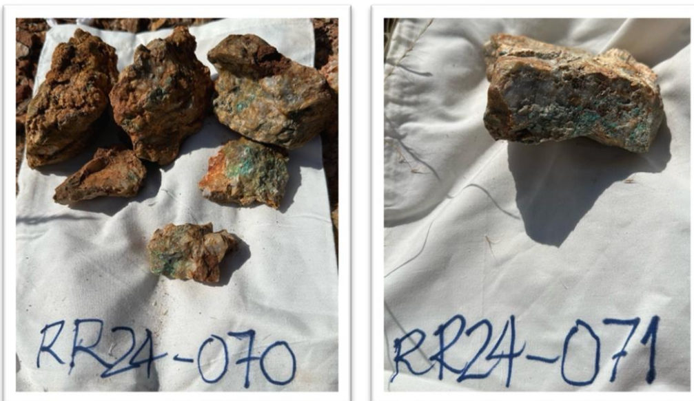
Figure 4. Rock chips taken from the Pine Hill Gold-Copper Prospect. RR24-071 assayed 55g/t Au and 2.4% Cu and RR24-070 assayed 1.6g/t Au and 0.6% Cu.