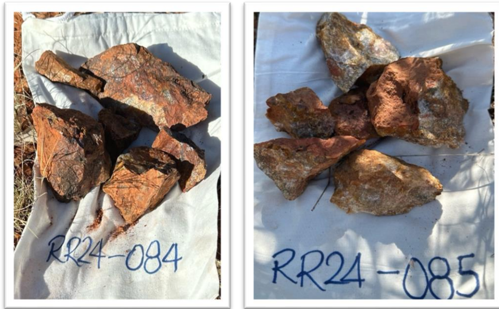
Figure 6. Rock chips taken for gold mineralisation at the Trout 2 Gold Prospect. RR24-084 assayed 8.2g/t Au and RR24-085 assayed 2.8g/t Au.