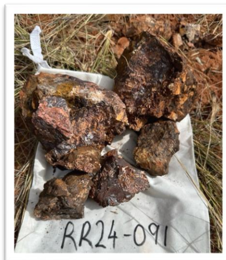
Figure 7. Rock chips taken for gold mineralisation at the Trout 2 Gold Prospect. RR24-084 assayed 8.2g/t Au and RR24-085 assayed 2.8g/t Au.