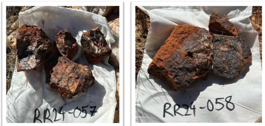
Figure 5. Rock chip samples of gossanous quartz veins from over the EM anomaly at the Scimitar Copper-Gold prospect. RR24-057 assayed 1.05g/t Au and 0.25% Cu and RR24-058 assayed 0.3g/t Au and 0.18% Cu.