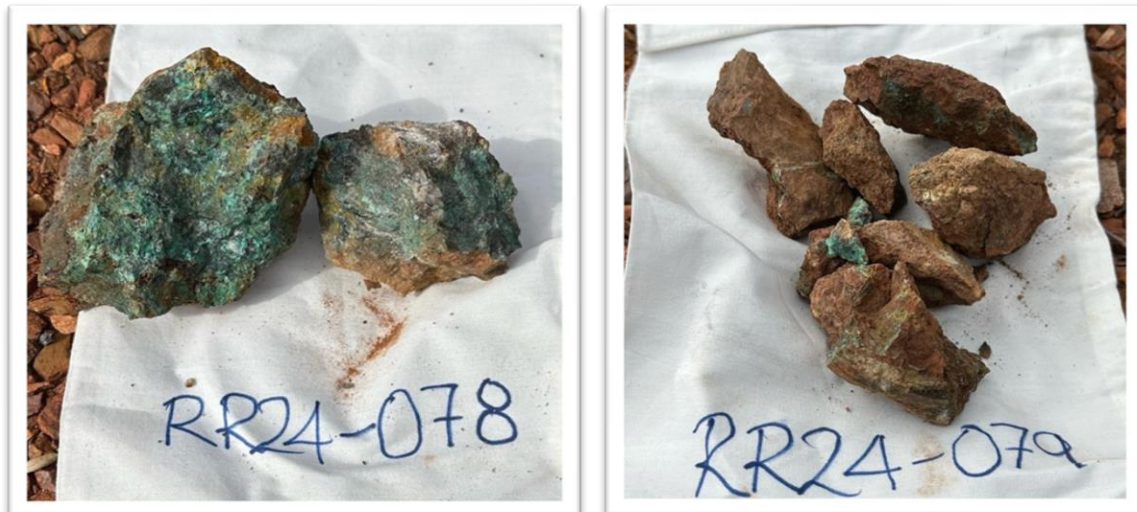
Figure 2. Rock chips taken for copper mineralisation at the Stanley Copper Prospect. RR24-078 assayed 29.1% Cu, 0.83g/t Au and 27.4g/t Ag and RR24-079 assayed 10.3% Cu and 0.2g/t A.