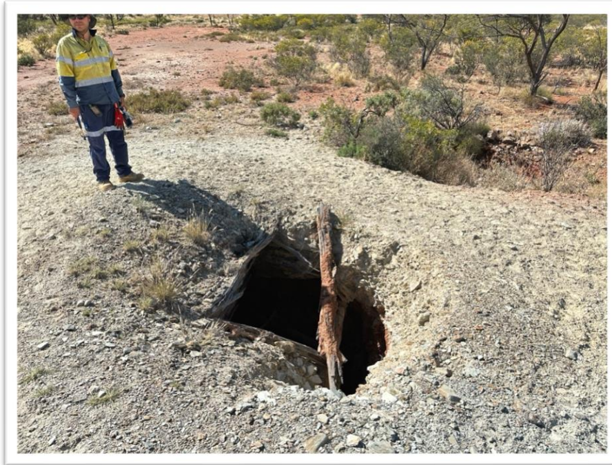
Figure 3. Historical mine shaft at the Pine Hill Gold-Copper Prospect.