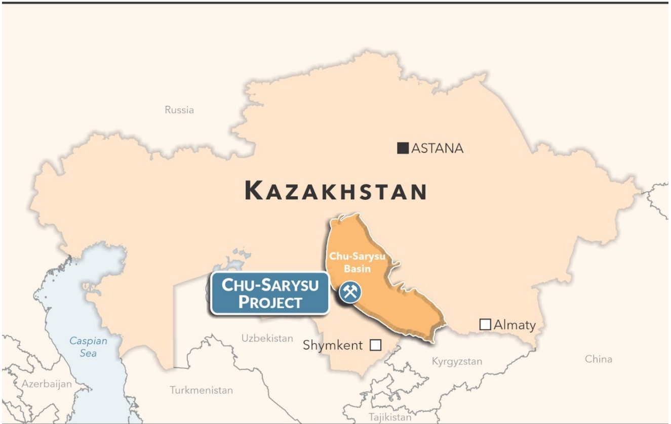
Figure 1: Map of Kazakhstan, showing project location in the Chu-Sarysu Basin