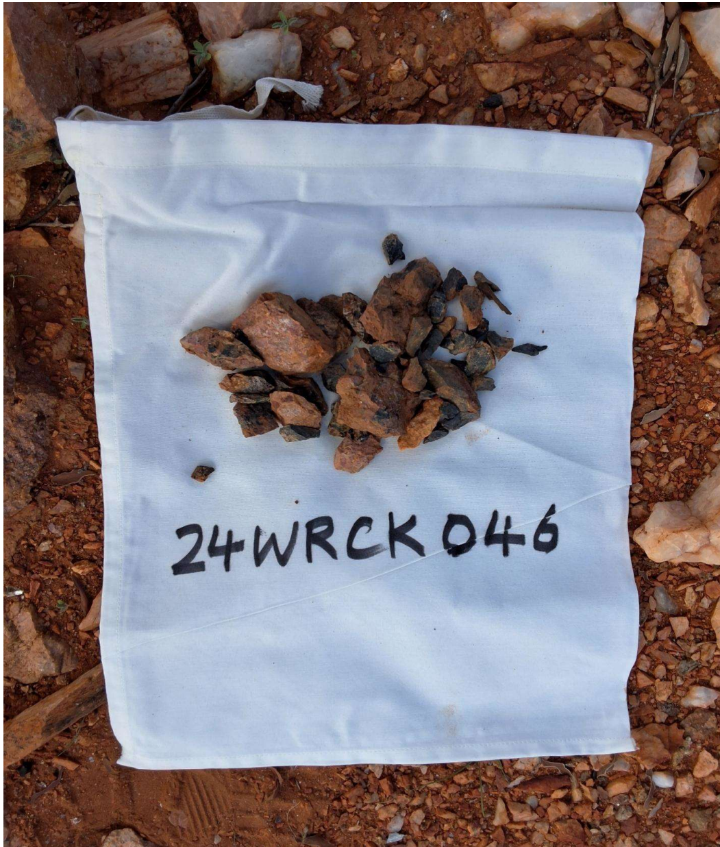
Figure 3: Large black rock fragments chipped directly from the in-situ granitic pegmatite outcrop, Wabli Creek, Gascoyne, W.A (Sample – 24WRCK046).

These latest in-situ results , in addition to the large ovoid intrusive feature (ASX Announcement 28 May 2024), provide a fundamental change in the prospectivity at Wabli Creek.