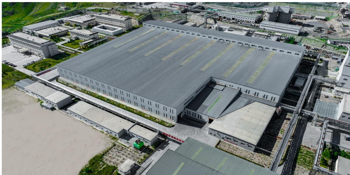
Above: Inner Mongolia Xingye Silver & Tin Mining Co. Ltd – Yinman Silver Mine, Inner Mongolia, China