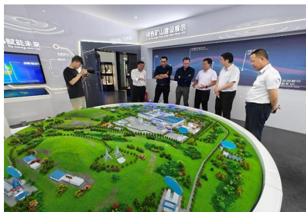
Upper Left: Inner Mongolia Xingye Silver and Tin Mining Co. Ltd – Office headquarters – Chifeng City, Inner Mongolia, China