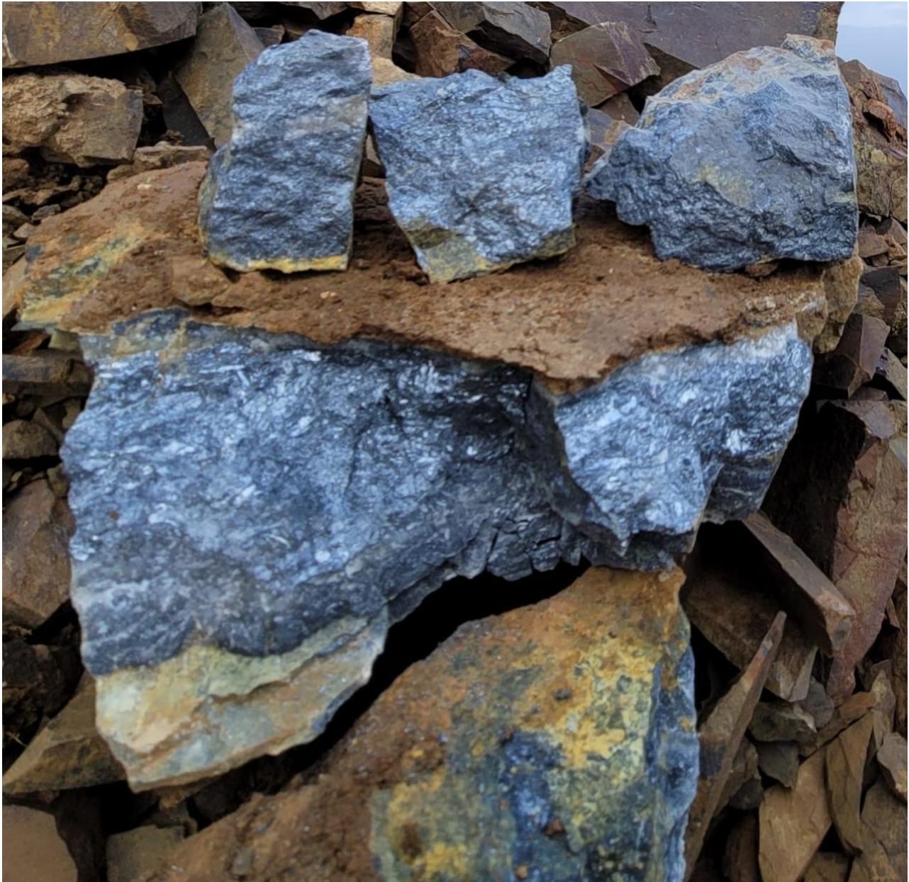
Figure 3. Massive Stibnite (Antimony) vein material at Styx

Over 2,500kg of antimony rich stibnite material has now been collected from Stibium, and 500kg from Styx, for test work to develop a process flow sheet and plant design in anticipation of a fast track production scenario. The Company is working with METS Engineering and the University of Alaska-Fairbanks CORE-CM group who will complete these studies, and have already received initial stibnite samples from the project. Numerous antimony and gold rich rock and soil samples collected from the prospects have also been sent to the ALS laboratory for analysis, with results expected back in the coming weeks.