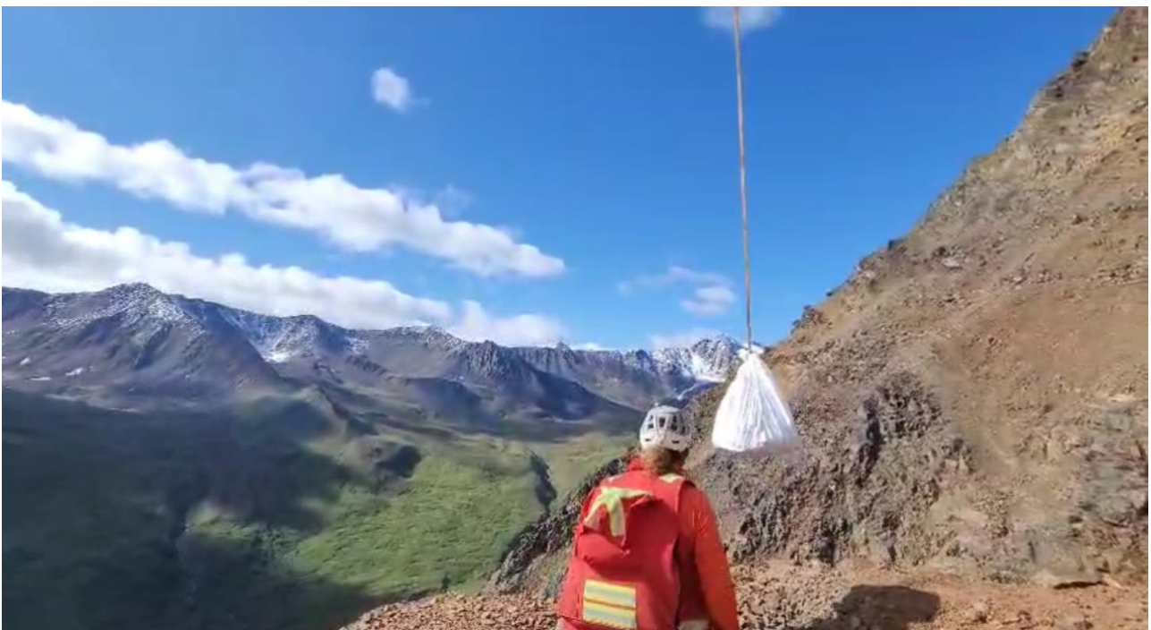
Figure 2. Bulk sample in transit from Stibium

With widespread massive stibnite (antimony) veining observed in surface mapping and sampling at Stibium (Figure 2) and Styx (Figures 3-4), the strong relationships the Company has developed with various US government agencies, and China recently announcing export restrictions on antimony , Nova sees a first mover opportunity to develop the prospects and supply antimony to the US domestic market in the near term.