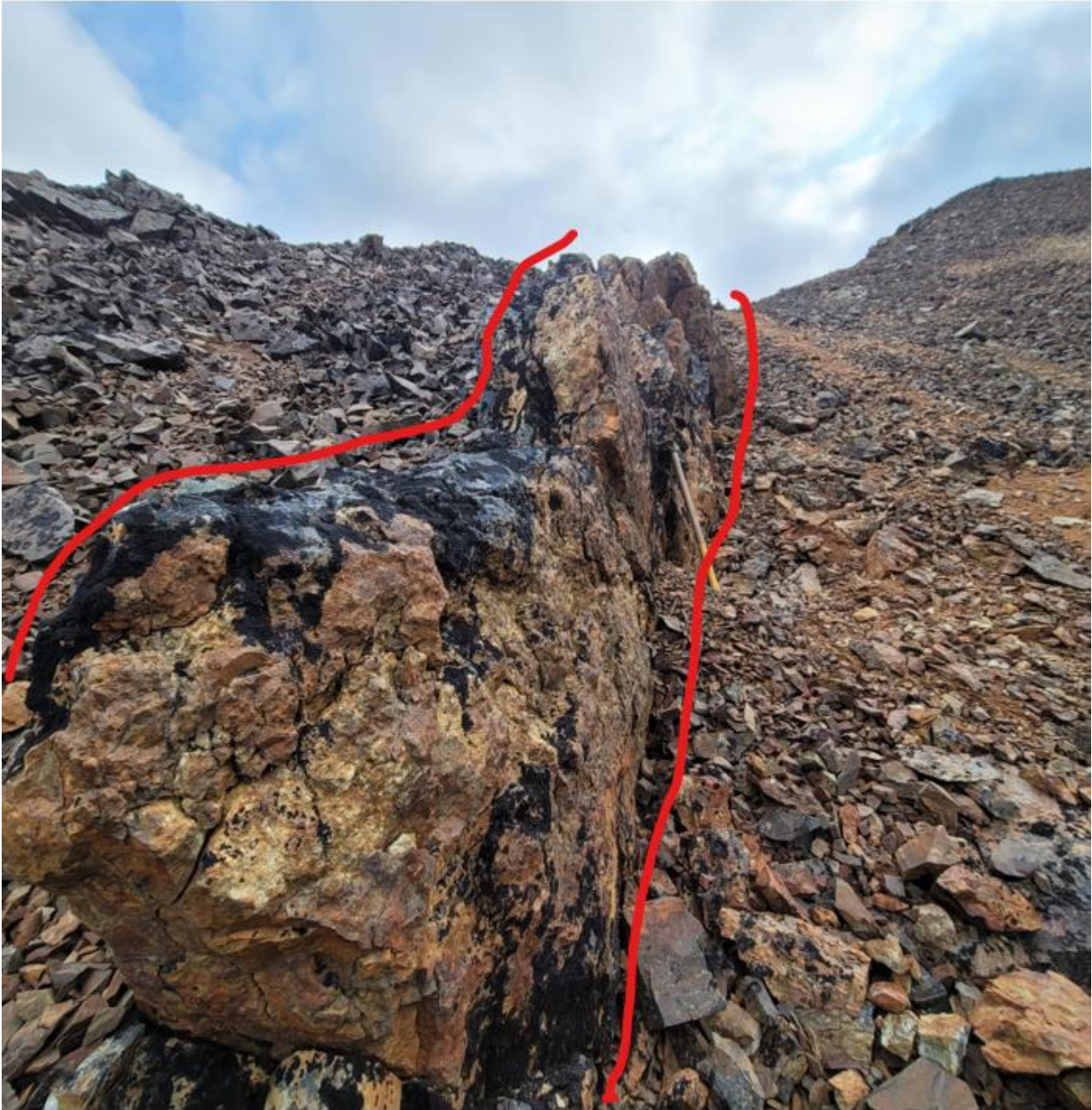
Figure 4. Large vein (~1m thick) containing massive stibnite in outcrop at Styx

Nova CEO Christopher Gerteisen has been invited to attend another Dept. of Defense (DoD) related conference in September to discuss Estelle's near-term antimony production potential and illustrate how Nova could potentially help the US establish and fully secure domestic critical minerals supply chains.