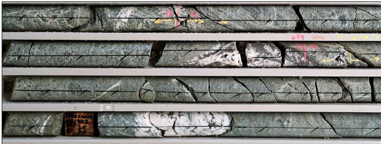
Figure 1: Gold and sulphide bearing quartz-barite veins in a zone which returned 8.5m @ 5.47g/t Au (LTDD22068)