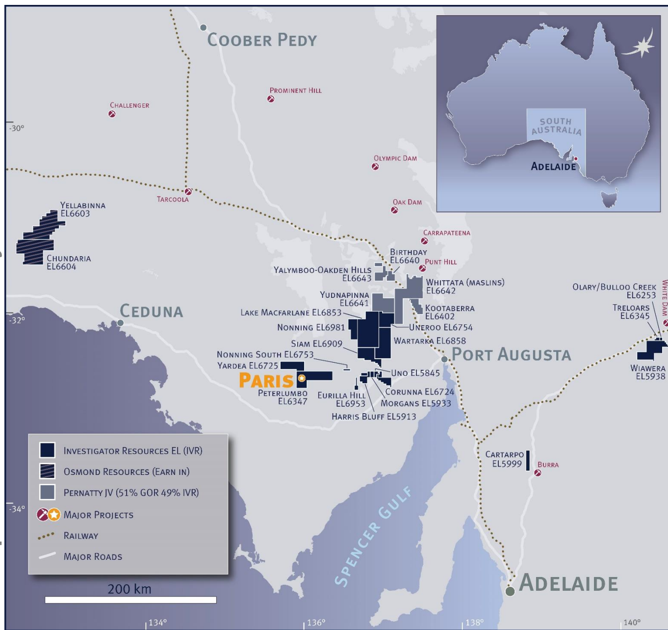
Figure 1: Investigator’s South Australian tenements