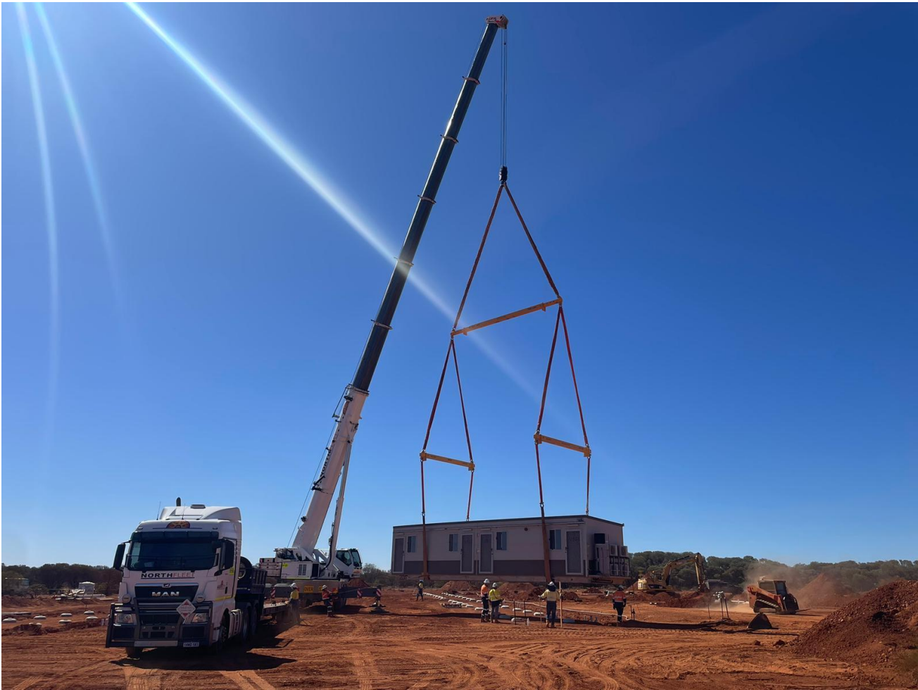
Figure 3: Accommodation village being installed.