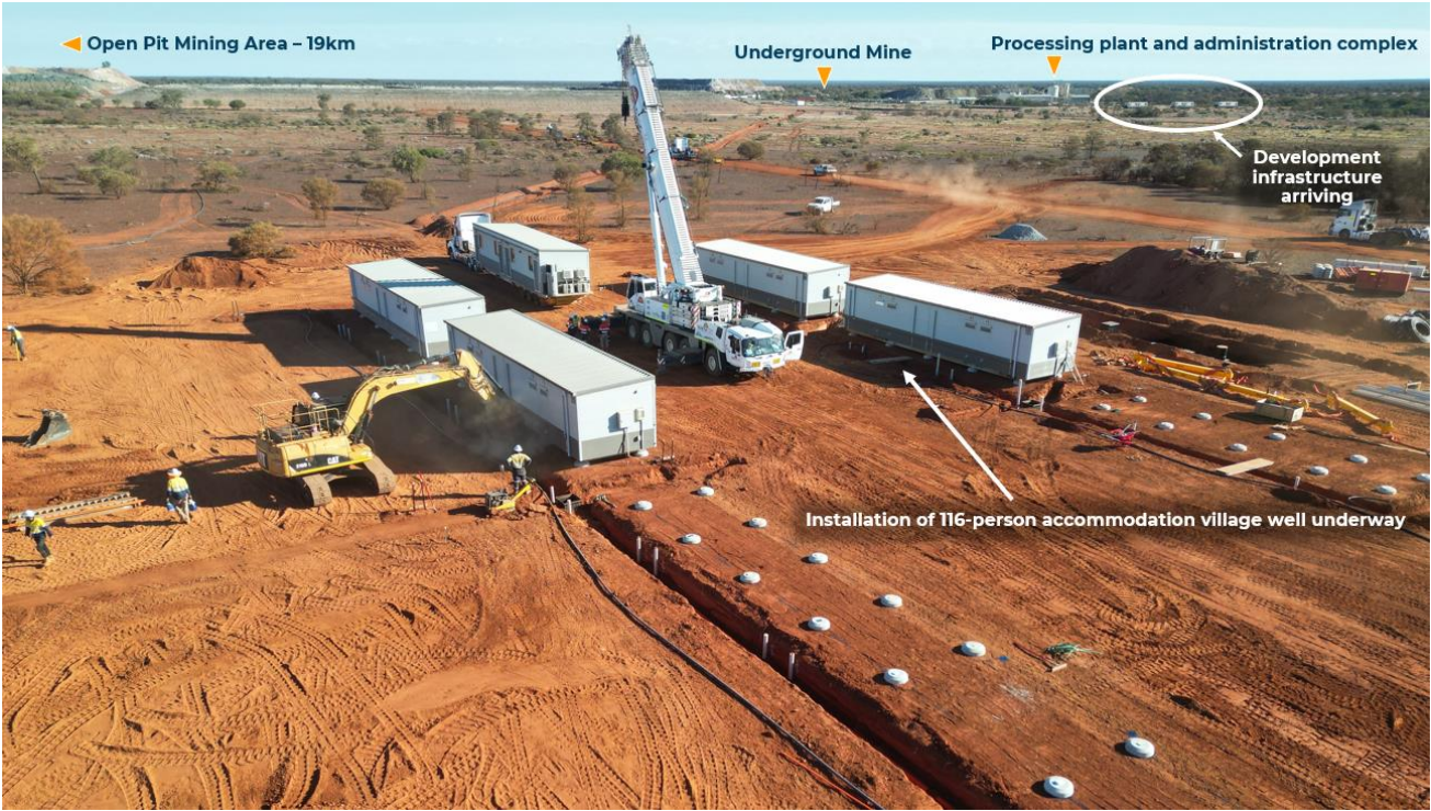
Figure 4: Accommodation village being installed.