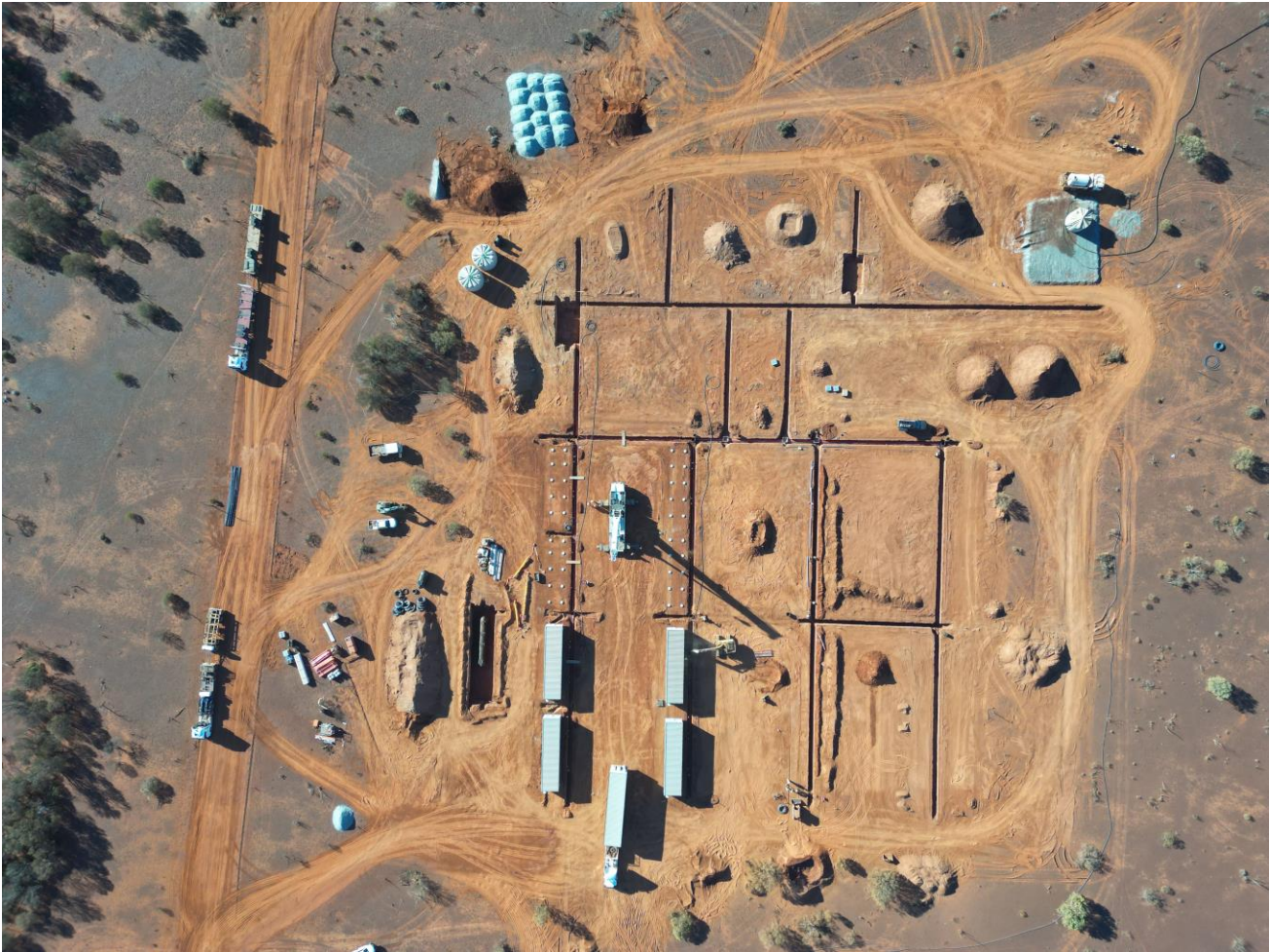
Figure 5: Aerial photo of accommodation village installation.