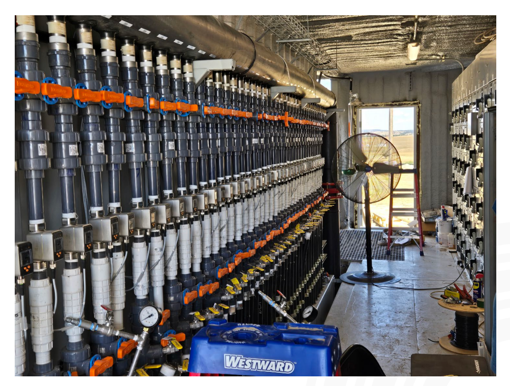
Figure 5: HH-11 interior under construction in August 2024