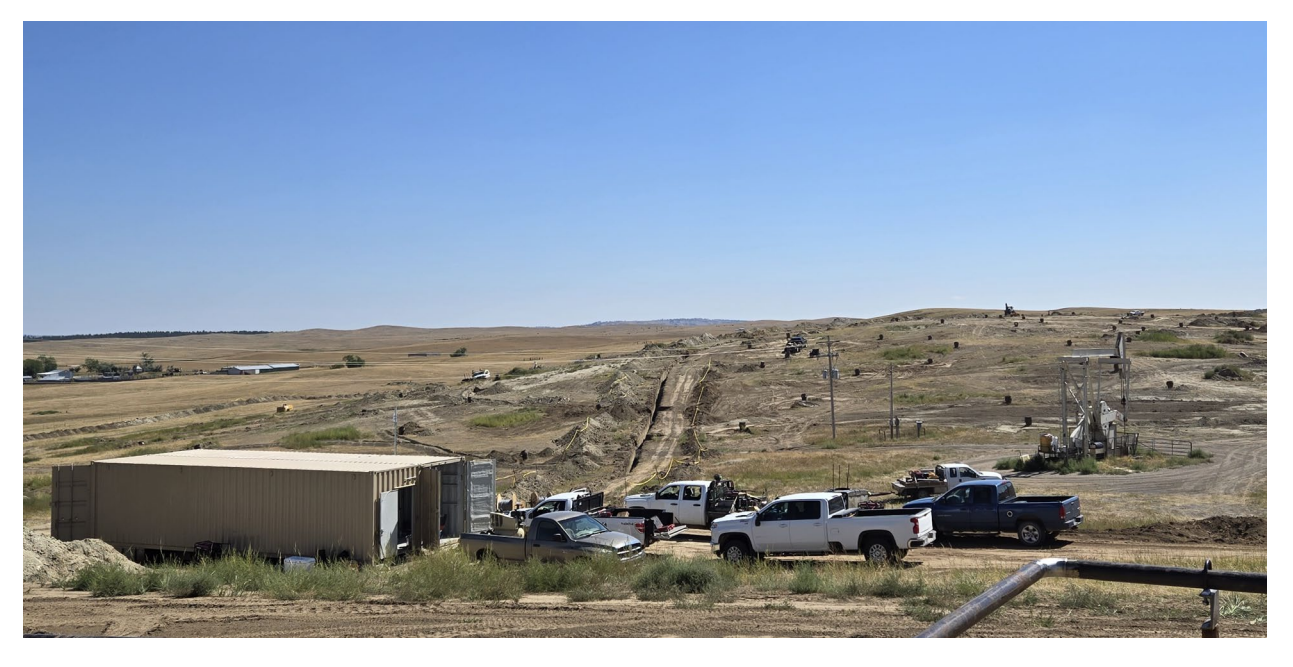
Figure 6: MU-3, HH-11 building in the foreground with installed wells in background