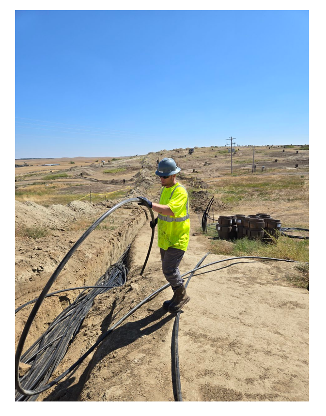
Figure 4: Connecting HH-11 wells to the header house building