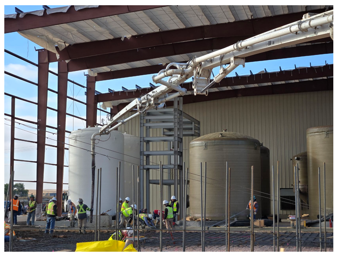
Figure 2: Concrete slabs being poured at the Lance process plant