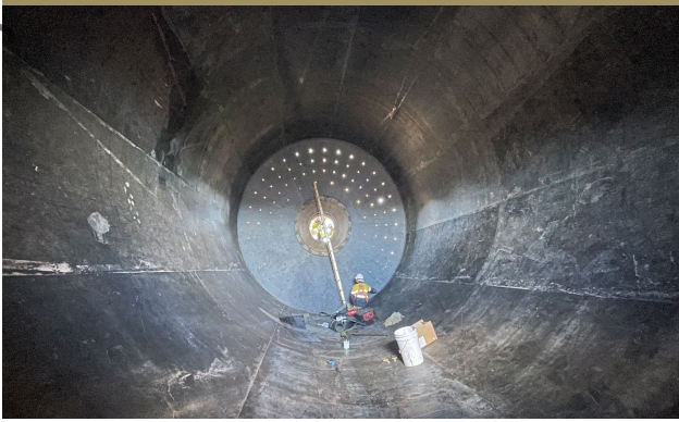
Laverton mill re-start - Ball mill relining