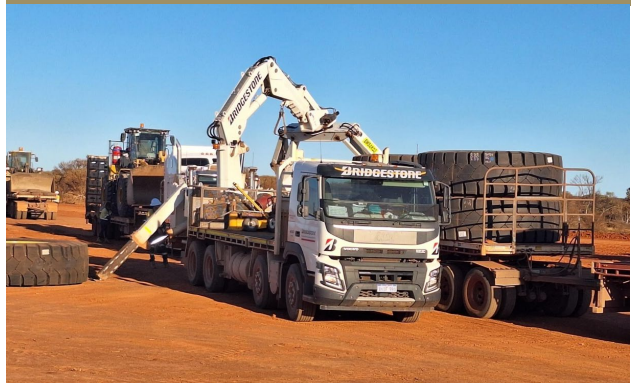
Hub open-pit - Bridgestone on site