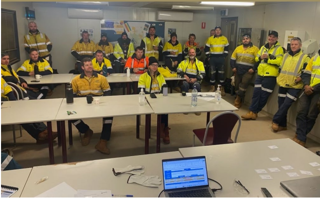
Laverton mill re-start - Safety meeting