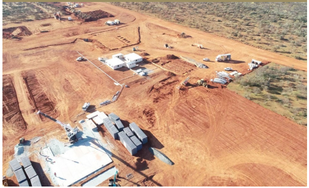
Hub open pit - Site infrastructure