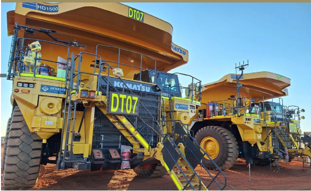
Hub open pit - New mining fleet