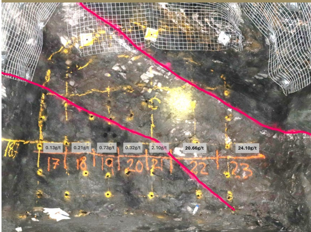
Ulysses underground - High grade ore development underway