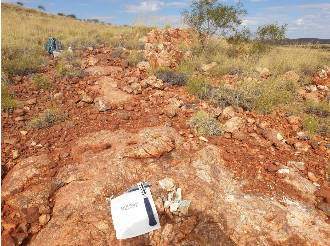
Figure 2: Andover South Project – Outcropping Pegmatite within E47/4062 4

This ASX announcement has been authorised for release by the Board of Raiden Resources Limited.