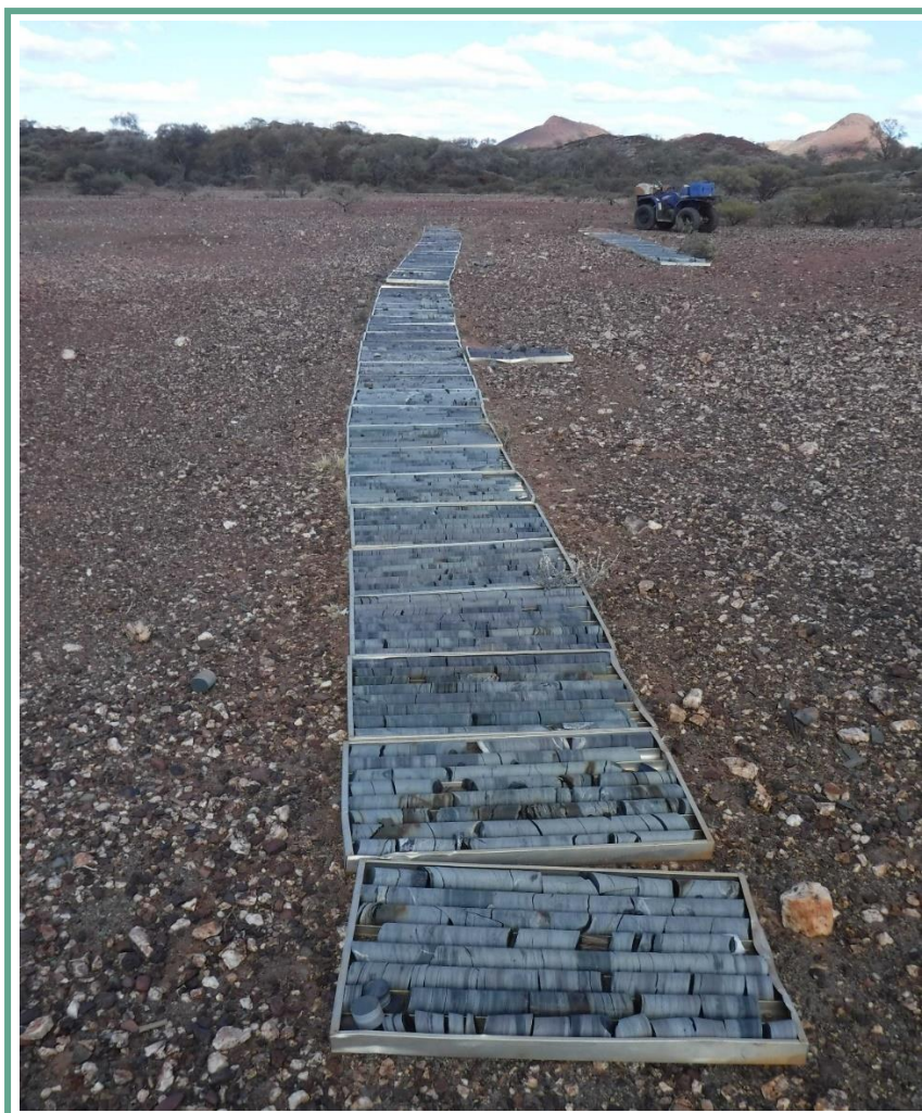
Photo 2: Historical diamond drill core onsite untouched for over 40 years.

(From ASX announcement 27 th August 2024).