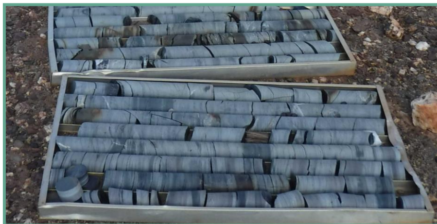
Photo 1. 1990’s historical diamond drill core on site, previously not sampled.