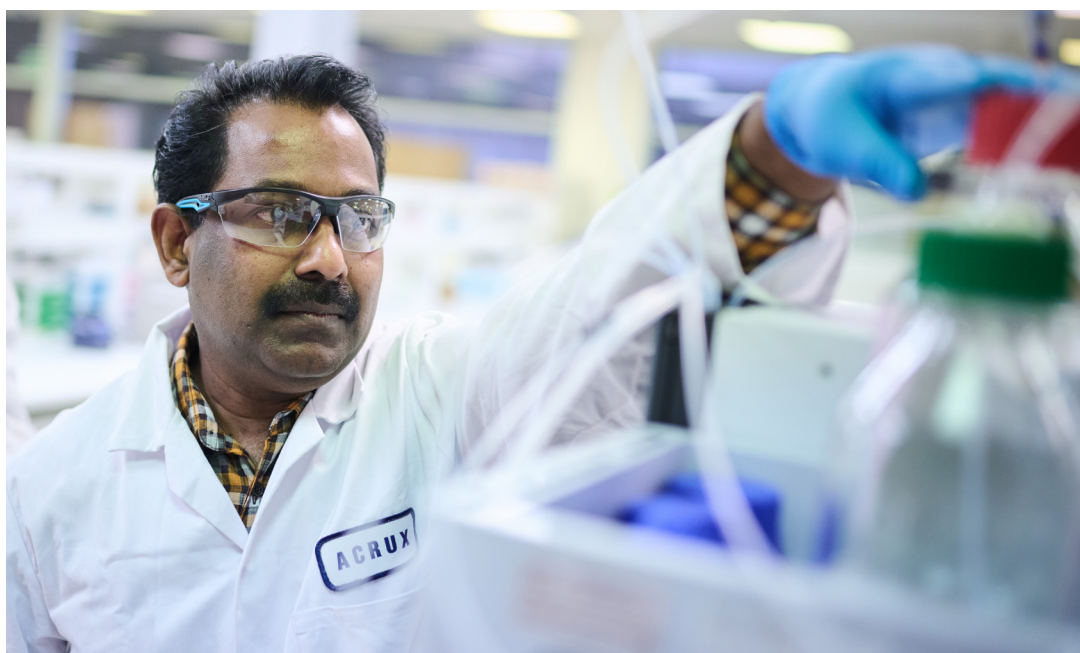
Analytical Development Scientist, Ebenezer