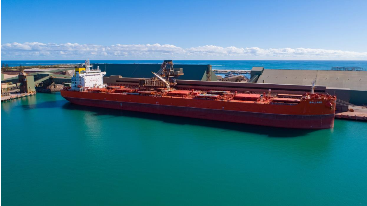
Fenix Geraldton Port facilities

Net Profit after Tax was up 15% to A$34 million.