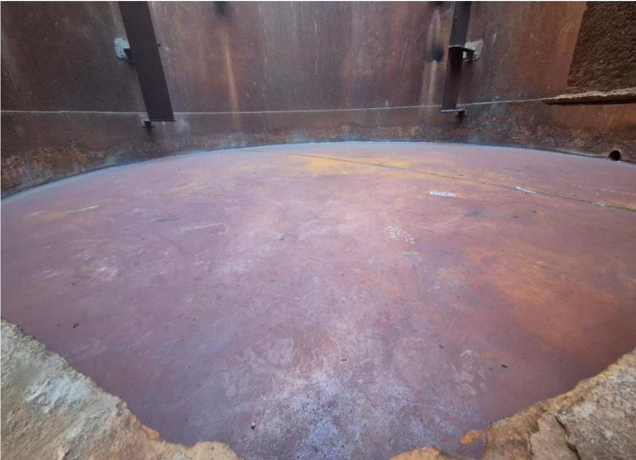
Figure 5: CIL tank floor repairs underway