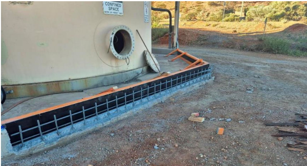
Figure 10: Remedial concrete works