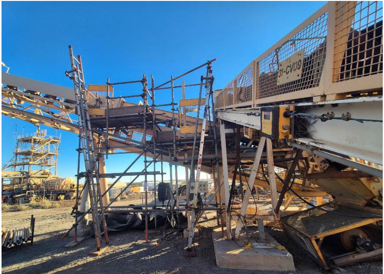
Figure 3: Conveyor chute repairs are underway