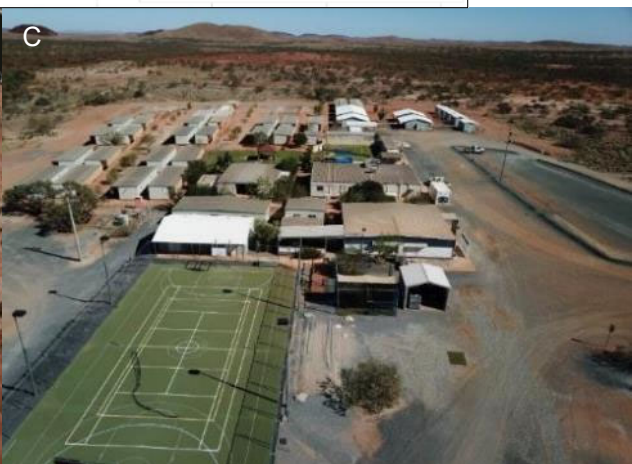
A: Schematic isometric long-section looking towards the north showing >2.7km of known mineralisation comprised of: Main Zone (~1Moz mined @ 1,000oz per vertical metre), under-drilled Eastern Zone, unmined Footwall Gabbro Zone and the Paulsens Repeat seismic target; B: Aerial view of Paulsens processing facility and site offices; and C: Paulsens village and camp