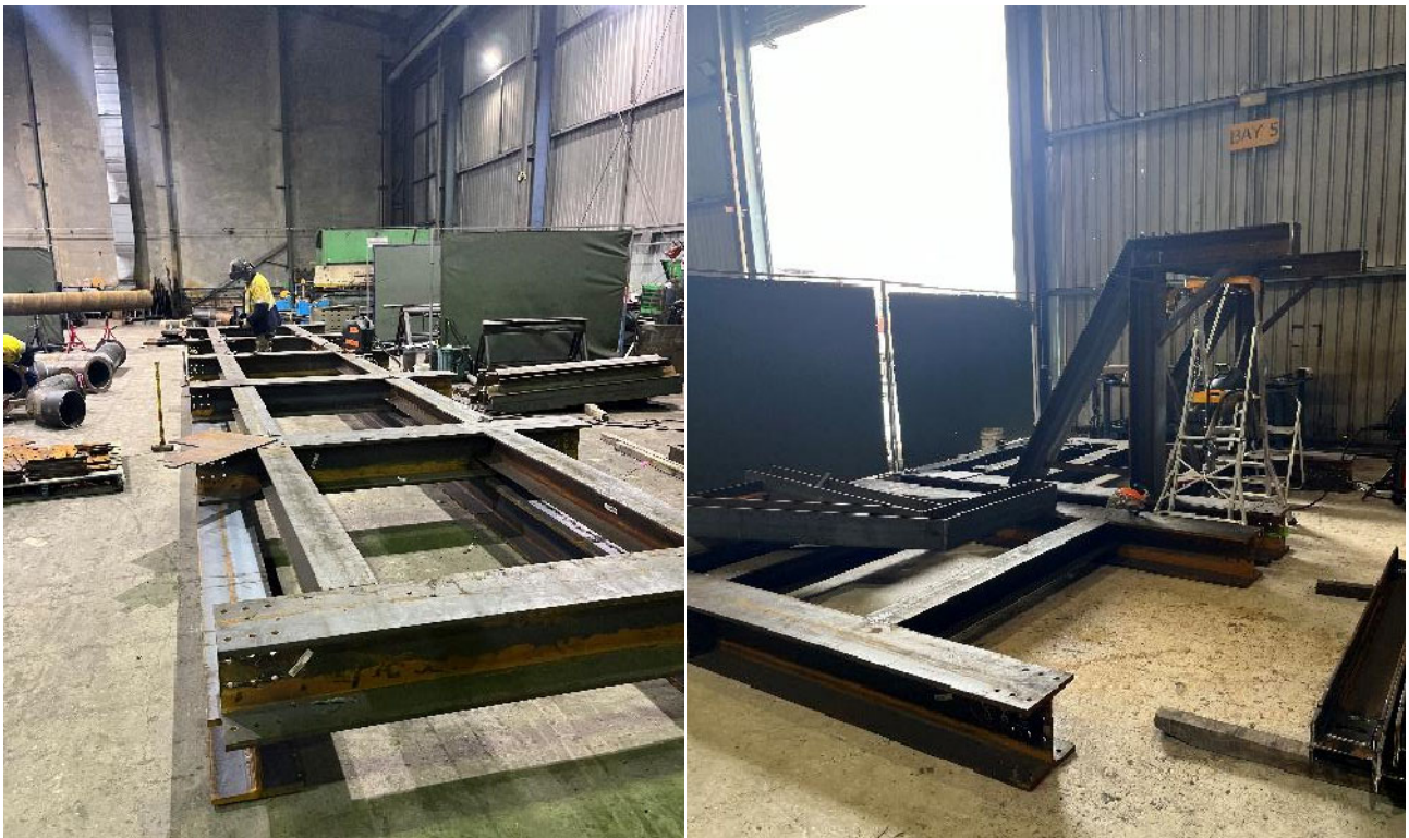
Figure 2: ROM wall fabrication progressing to plan