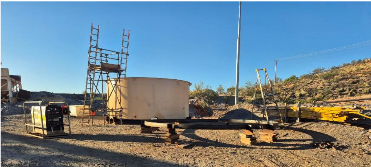
Figure 6: New CIL top of tank ring ready for installation