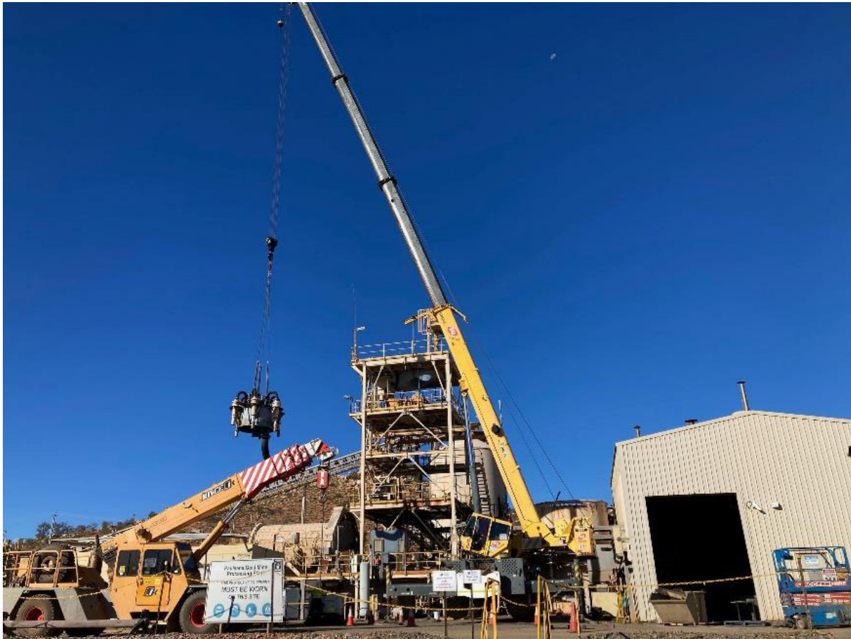
Figure 9: Cyclone cluster removal, cluster will be sent to Perth for repairs and rubber lining.