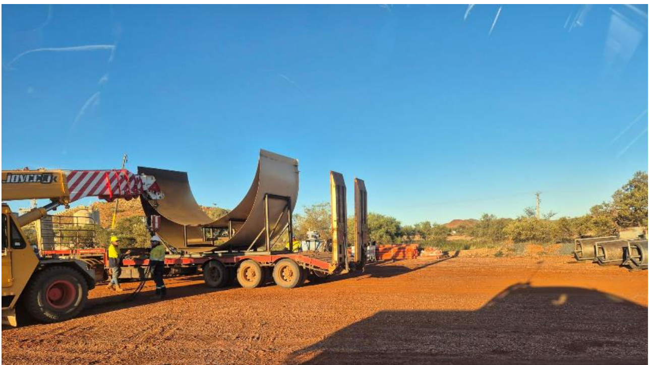
Figure 8: Next batch of CIL tank rings arriving for assembly and installation