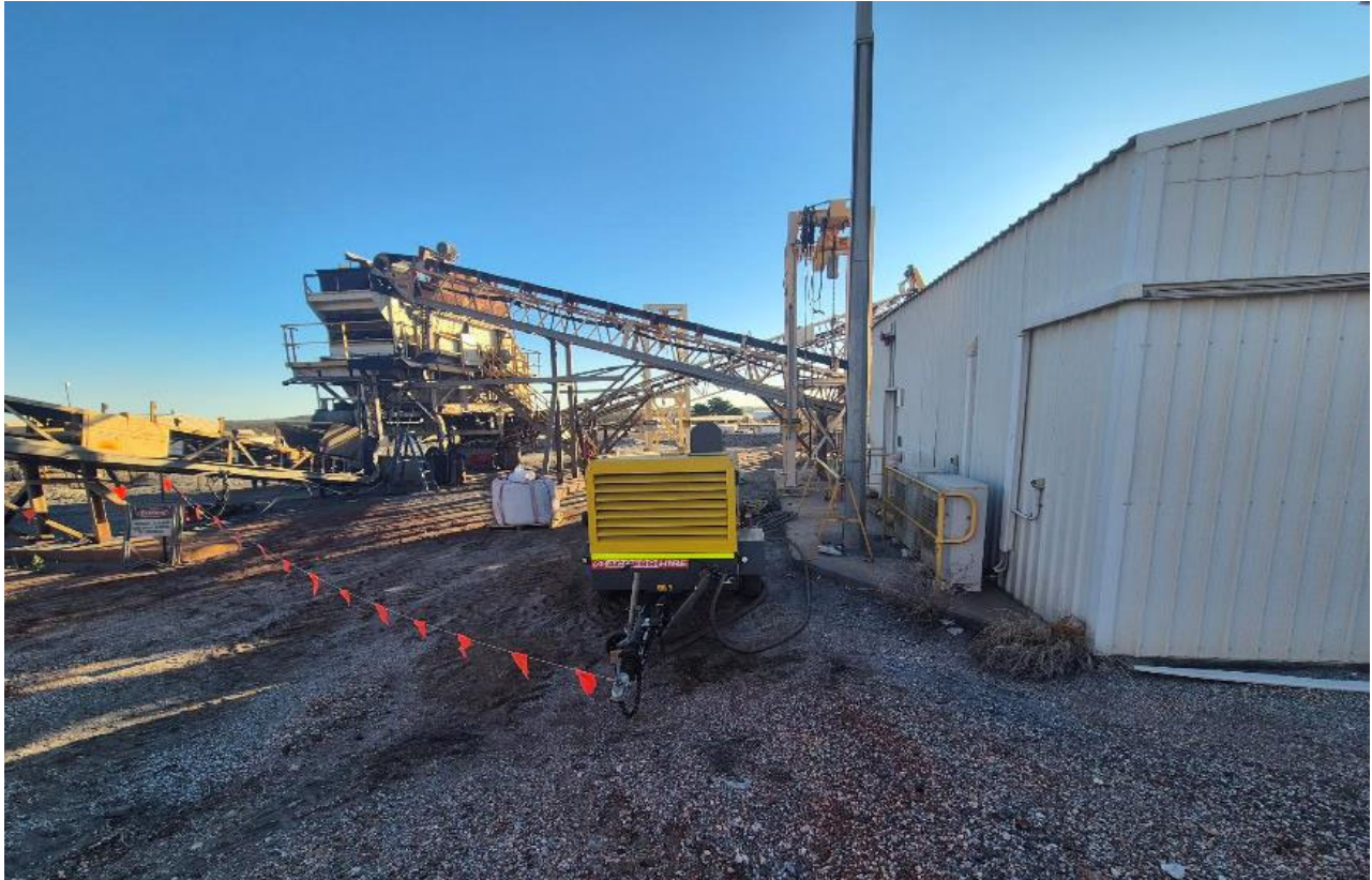
Figure 4: Sand blast and painting crews setting up at the crushing circuit