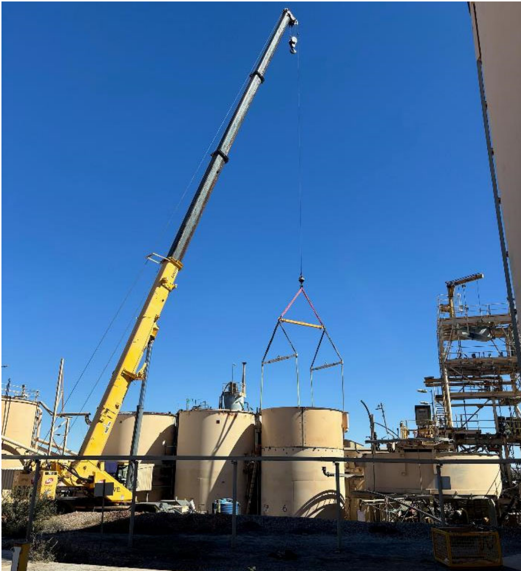
Figure 7: First CIL tank rings to be installed