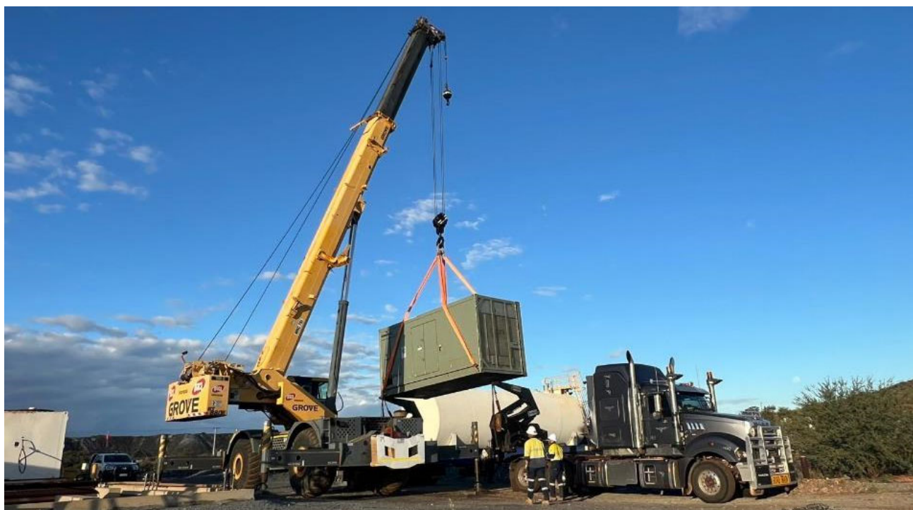
Figure 1: Power station #2 generator installation

Black Cat's Managing Director, Gareth Solly, said: “ The processing facility refurbishment activities are progressing safely and efficiently with commissioning on target for December 2024. ”