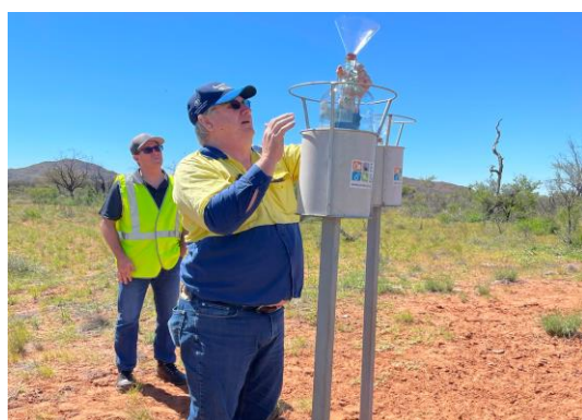
Figure 3: Passive dust collection monitoring