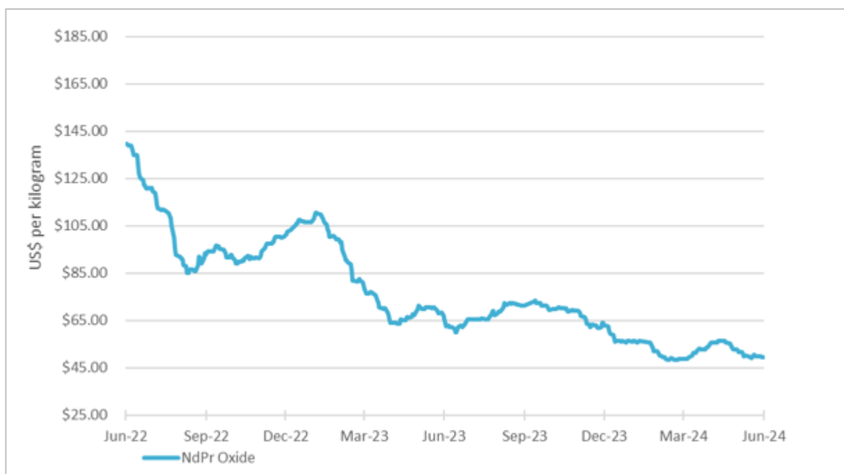
Table 1: NdPr oxide price EXW China (inclusive VAT) converted to US$

The US Government announced in May that import tariffs would be imposed on a range of Chinese products including rare earths and permanent magnets. Rare earths will be subject to a 25 percent tariff beginning in 2024 and a tariff on permanent magnets will be imposed from 2026. The Company anticipates that this is likely to further promote the development of magnet production capacity outside of China, leading to increased diversification and demand for NdPr. This is particularly beneficial for Arafura as an NdPr oxide producer supporting the diversification of magnet supply chains servicing the energy transition technologies of automotive and wind OEMs.