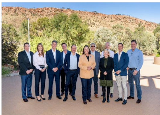
Figure 6: Federal Minister for Resources and Northern Australia Madeleine King met with Arafura's Board and Leadership Team in Alice Springs

The May Board meeting was held in Alice Springs, which provided an opportunity for Board members and the Leadership Team to engage key stakeholders on the Project.