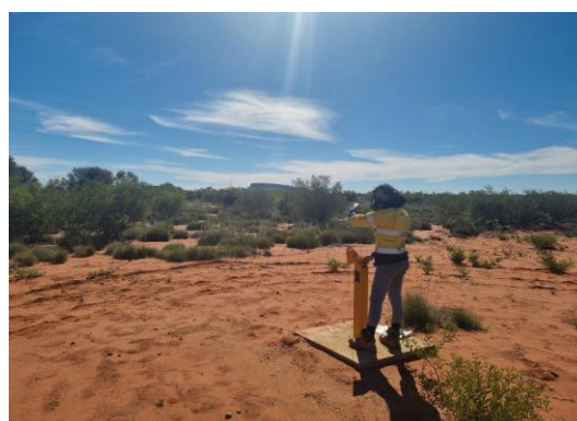
Figure 4: Ground watering monitoring