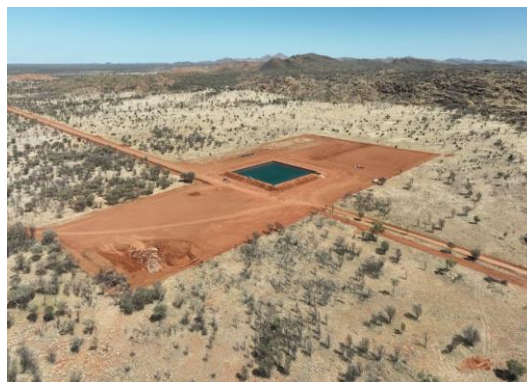
Figure 2: Aerial view of the Turkey's Nest