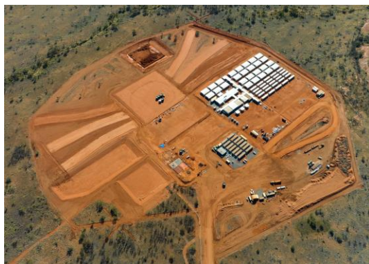
Figure 1: Aerial view of the Nolans Project

Nolans is shovel ready and the Company will commence construction activities immediately upon reaching FID.