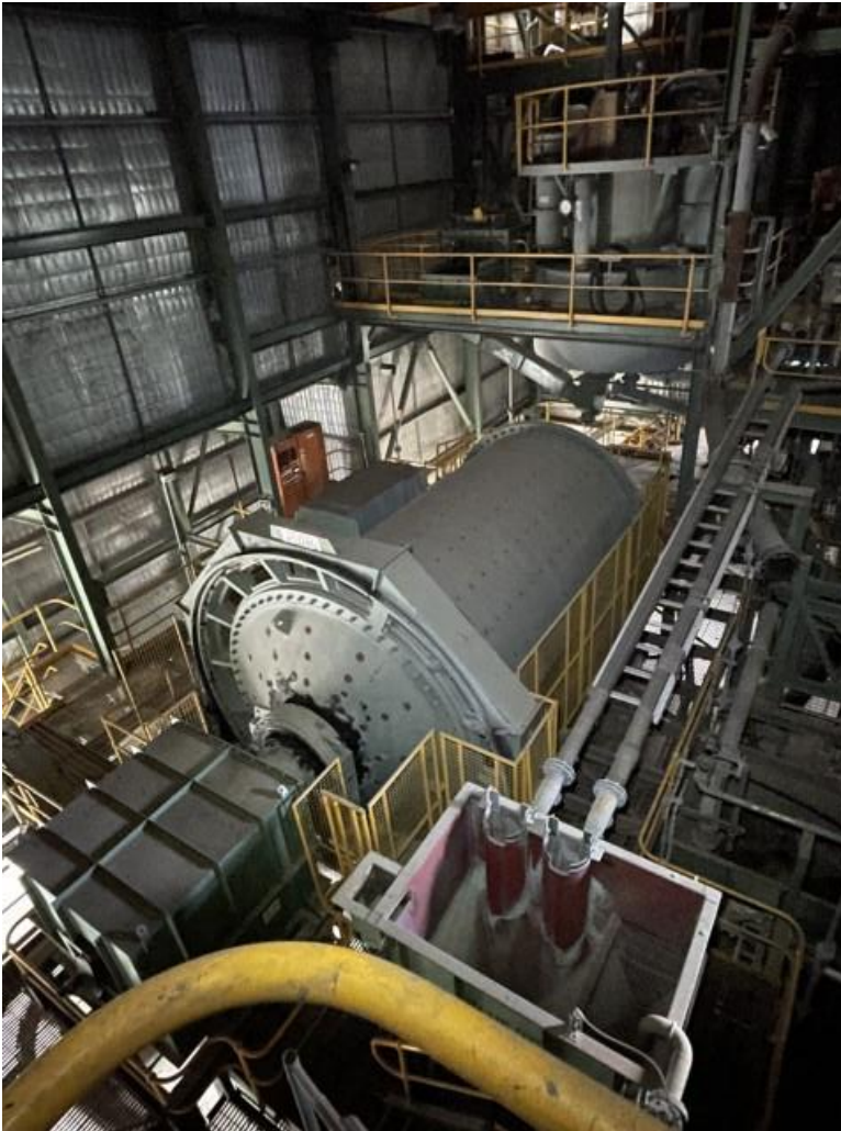
Figure 2: 750kW Outokumpu ball mill (April 2024) prior to being transported to the Murchison Gold Project.