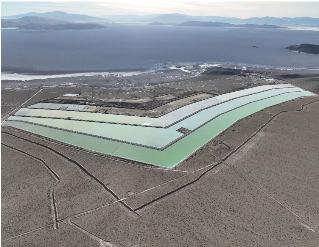
First 3 ponds completed, filled and evaporating