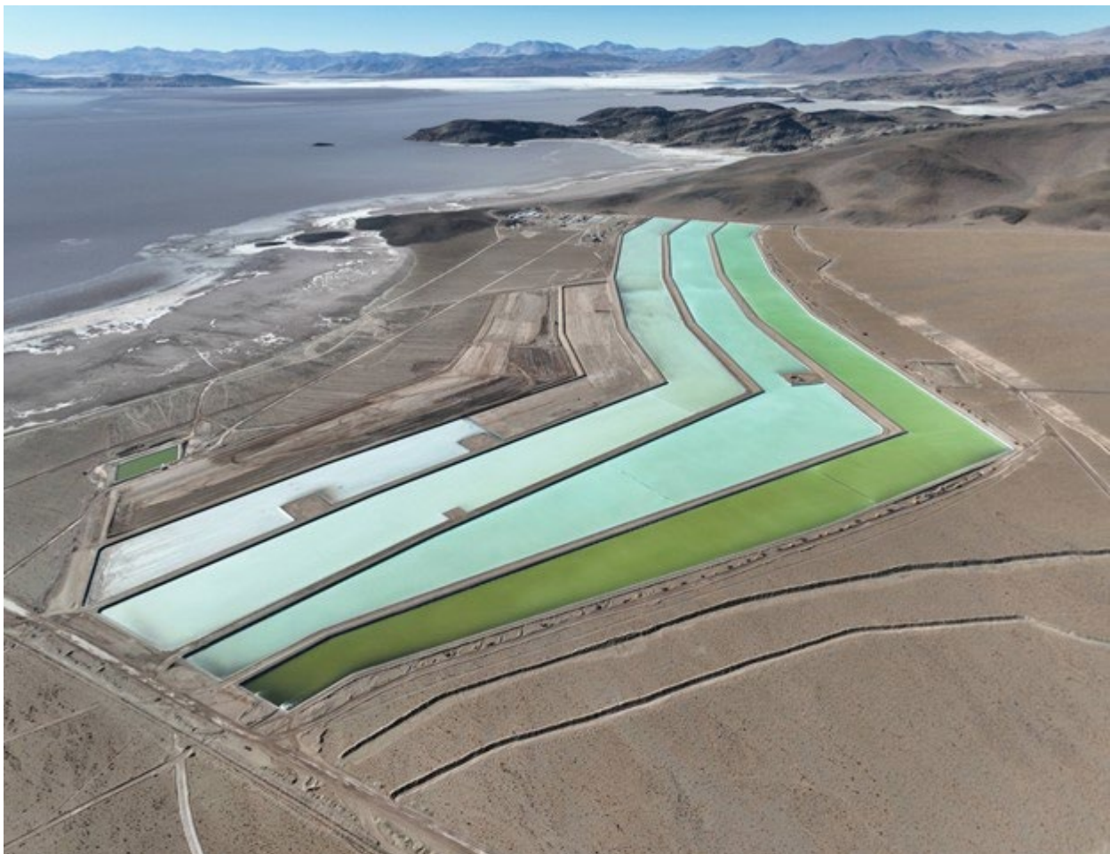
HMW Project looking south

As previously announced, the HMW project was separated into four production phases. The initial Phase 1 Definitive Feasibility Study (DFS) focused on the production of 5.4ktpa LCE of a lithium chloride concentrate by H2 2025, as governed by the approved production permits. The Phase 2 DFS targets 21ktpa LCE of a lithium chloride concentrate in 2026, followed by Phase 3 production of 40ktpa LCE by 2028 and finally a Phase 4 production target of 60ktpa LCE by 2030. Phase 4 will include lithium brine sourced from both HMW and Galan's other 100% owned project in Argentina, Candelas. The positive Phase 2 DFS results were announced on 3 October 2023 ( https://wcsecure.weblink.com.au/pdf/GLN/02720109.pdf ).