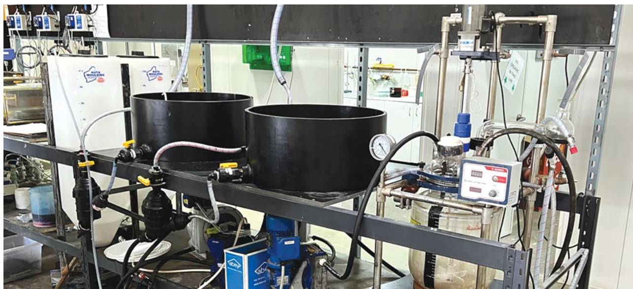
Figure 2 – Cobalt sulphate crystalliser and filtration pans

This work is expected to run until at least Q3 2024 and is critical to underpinning the detailed engineering design . We expect to appoint the engineering firm in the near future.