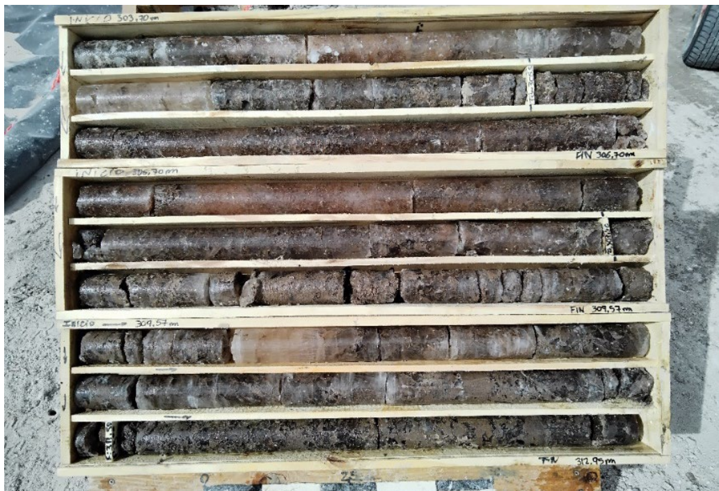
Figure 2 – DDH-1 core trays from 305-312 metres.

Following completion of DDH-1, the onsite drilling crew will relocate and mobilise to DDH-2 on the Sal Rio II tenement. The drilling of DDH-2 is expected to reach depths of 500-600m below the surface consistent with DDH-1, where drilling was significantly deeper than the existing defined JORC mineral resource depth. Pursuit is targeting a material resource upgrade in 2024, which will build on the recent maiden resource defined at the Rio Grande Sur Project. 1