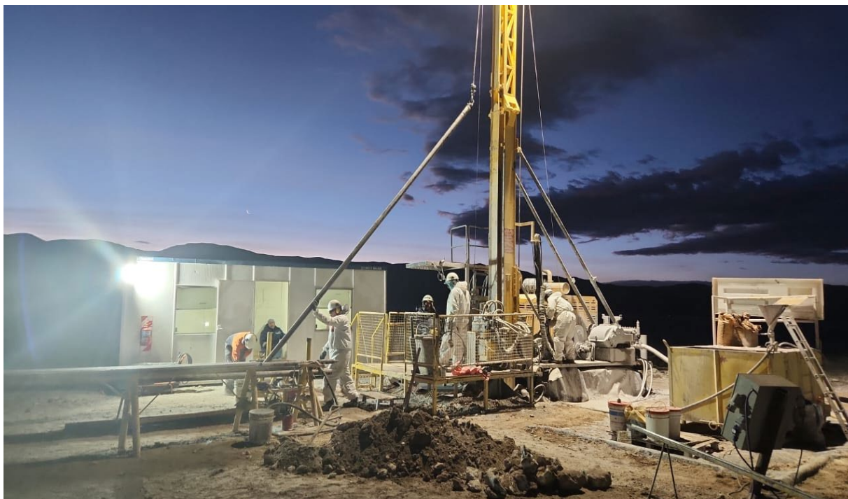
Figure 1 – Drilling crew onsite drilling DDH-1

Throughout the first several hundred metres, the on-site geologists and drilling team have been extremely encouraged by the geological units encountered. Of particular interest, at approximately 100-130m a highly porous sandy unit was encountered with Lithium brine grades substantially above expectation, based on historical drilling results. This zone has been earmarked as the potential location of a pumping well due to its heightened porosity and grade.