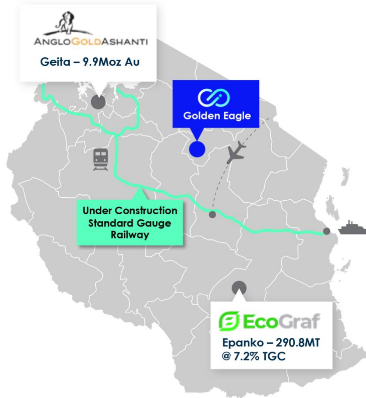
Figure 2: AngloGold and EcoGraf’s Major Tanzanian Projects and Operations 1, 4