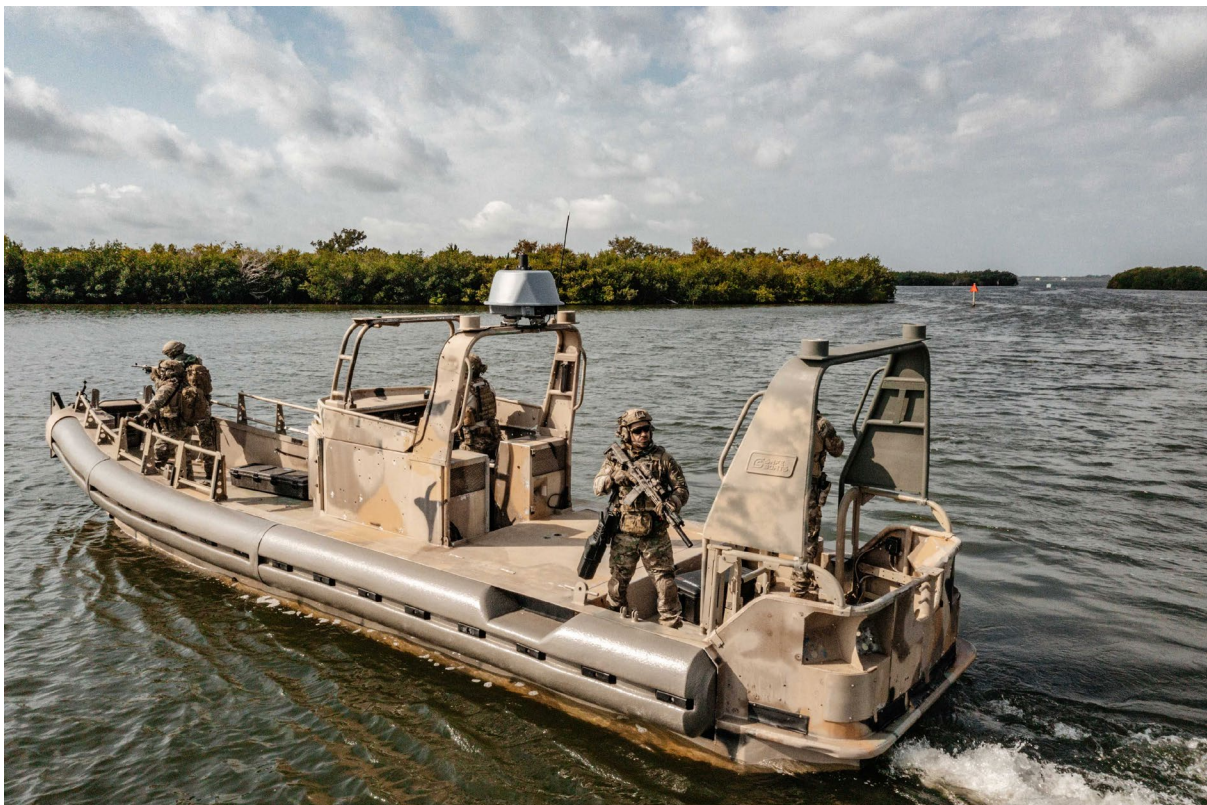
Image: DroneSentry-X C-UxS system installed on a maritime platform