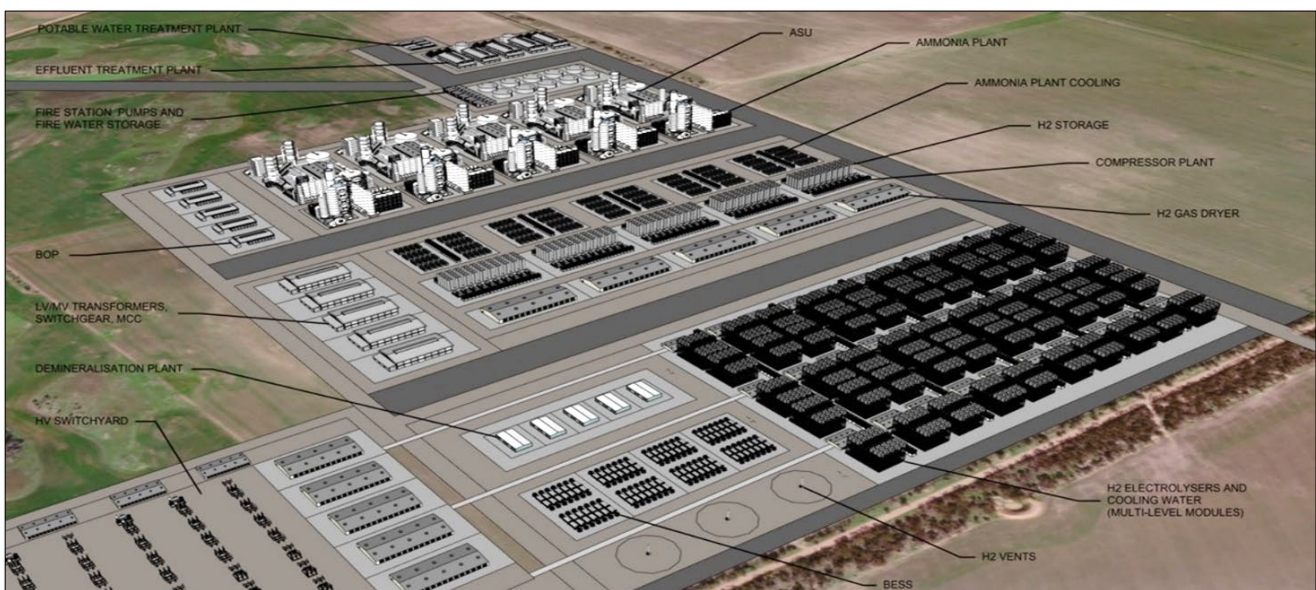
Figure 1: Key plant building blocks, Cape Hardy 5GW green hydrogen / ammonia production.