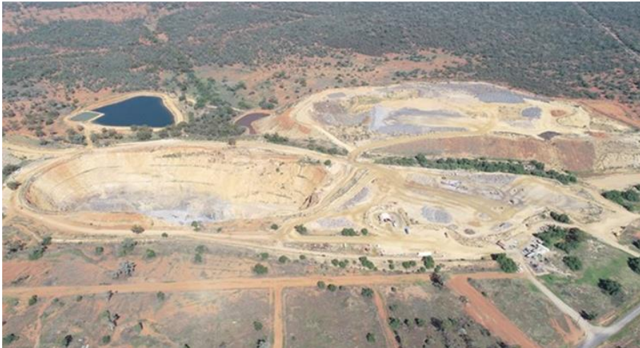
Mt Boppy Gold mine