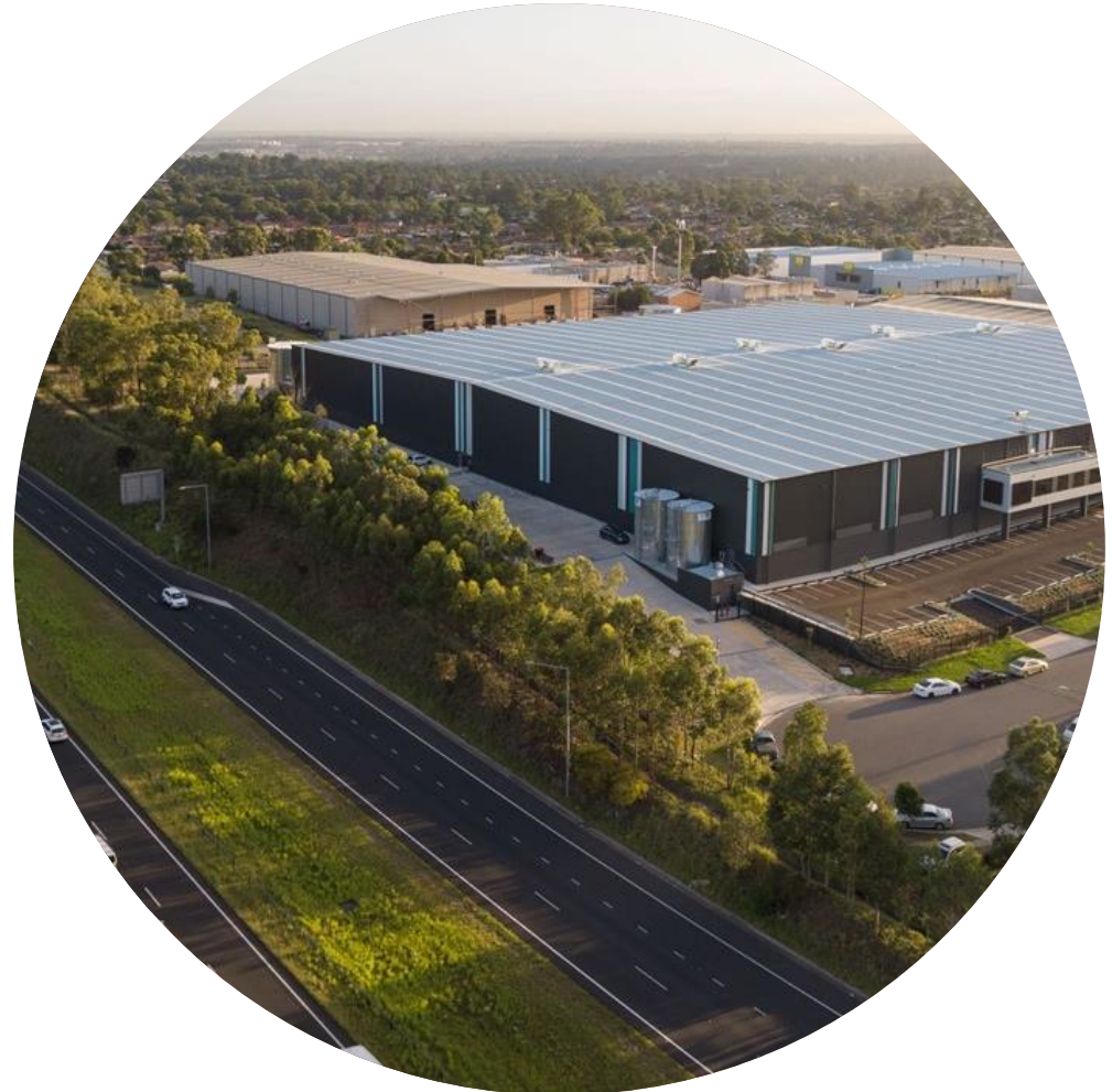
42 Cox Place, Glendenning, NSW