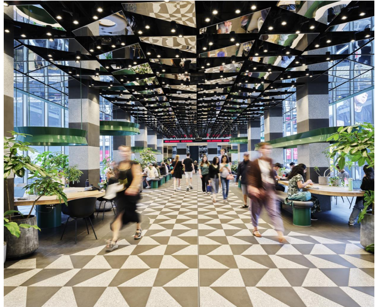
Melbourne Central, Victoria