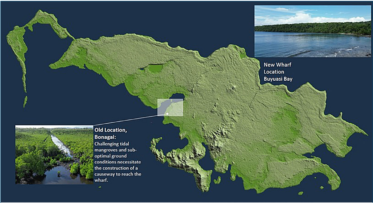
Old and proposed new wharf locations

The revised wharf location reduces the challenges associated with construction through the Bonagai mangroves and eliminates the requirement for a dedicated road out to the marine facility. Preliminary assessments of wave and bathymetry data support suitability of the wharf at Buyuasi Bay.