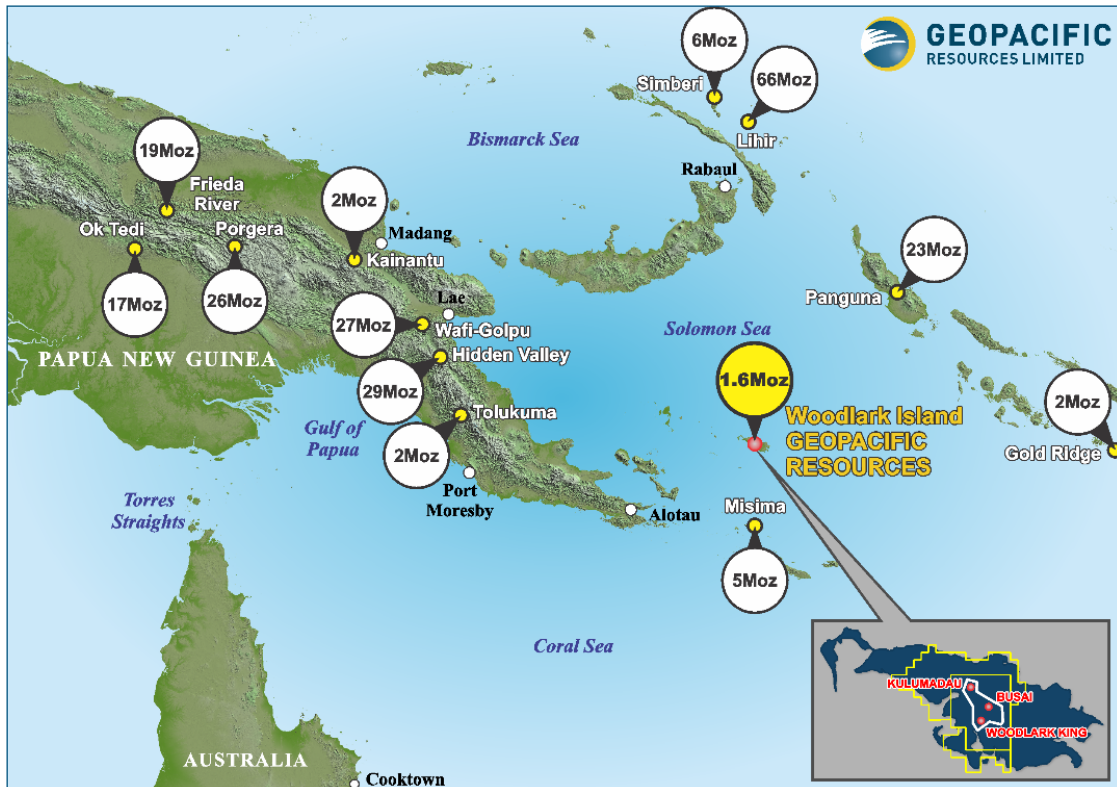
Woodlark’s regional setting – the “Pacific Ring of Fire”

Key Project permits are in place and Geopacific Resources Limited (Geopacific or the Company) is positioned to leverage off extensive previous investment in drilling, development studies, assets and infrastructure.