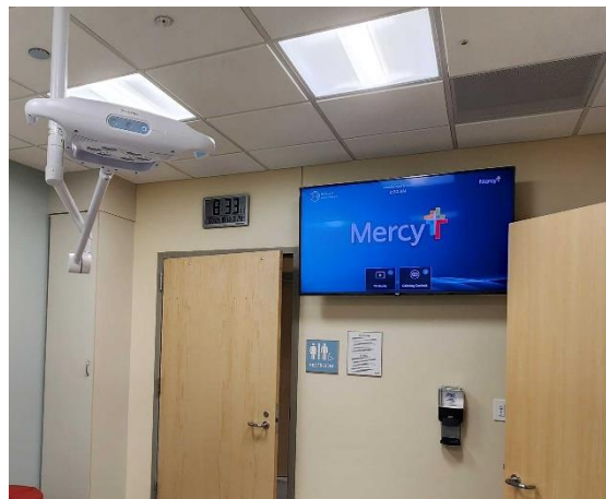
Oneview installation in Mercy's Love Family Women's Center in Oklahoma City went live on 7 th April 2024