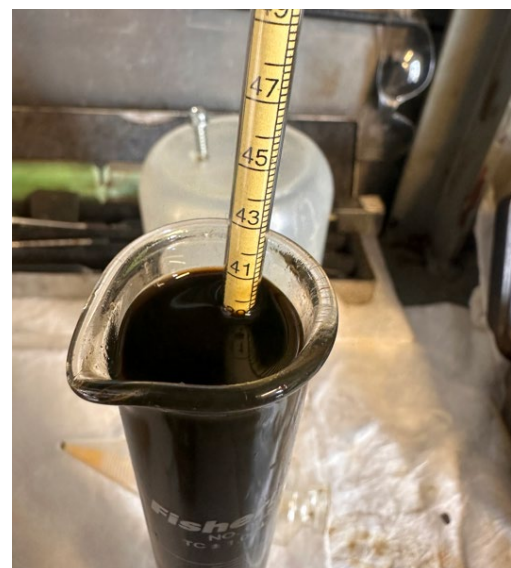
Figure 1: Light oil sample from the SMD-B flow test.

Multiple oil samples were recovered, with measured oil gravities of between 38.5 to 39.5 API, representing a light crude oil.