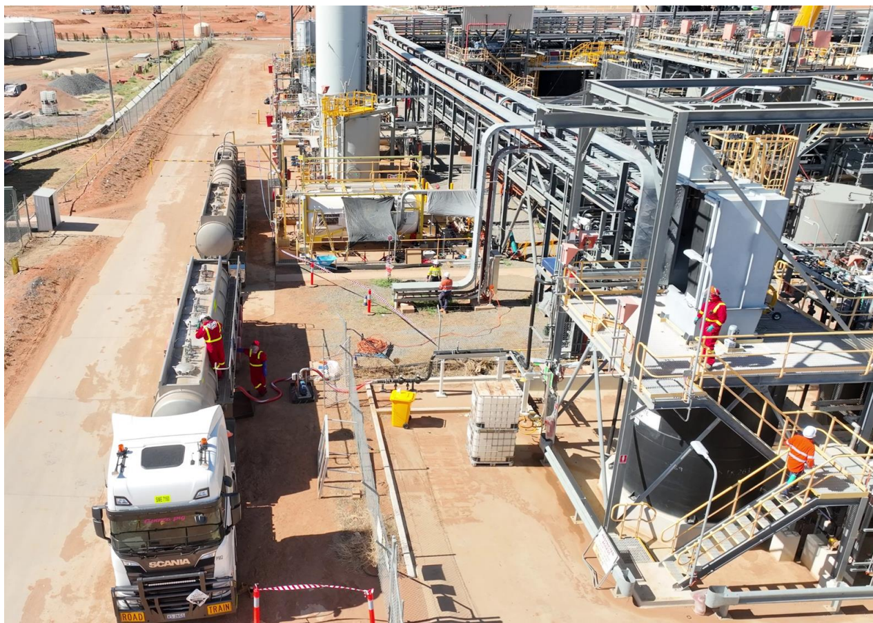
Figure 1. All long-term supplier contracts finalised and all reagent tanks filled on Honeymoon

During the IX production process, uranium is being chemically extracted until the solution is said to be “barren”, or no longer rich in uranium. The remaining barren liquor will be refortified with acid and oxidant before it is recycled back to the wellfield to repeat the dissolution process.