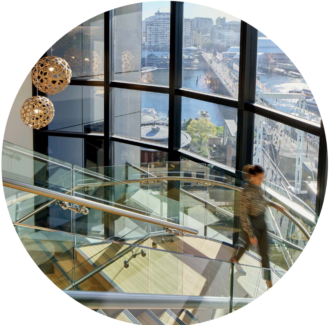
Darling Park, Sydney