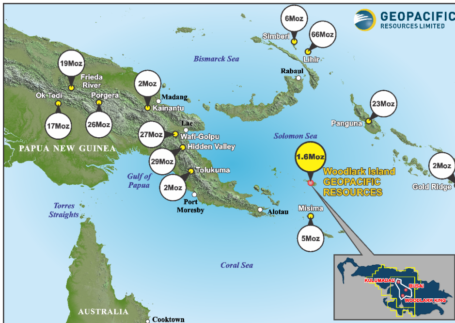
Woodlark's regional setting – the "Pacific Ring of Fire"

Key Project permits are in place and Geopacific Resources Limited ( Geopacific or the Company ) is positioned to leverage off extensive previous investment in drilling, development studies, assets and infrastructure.