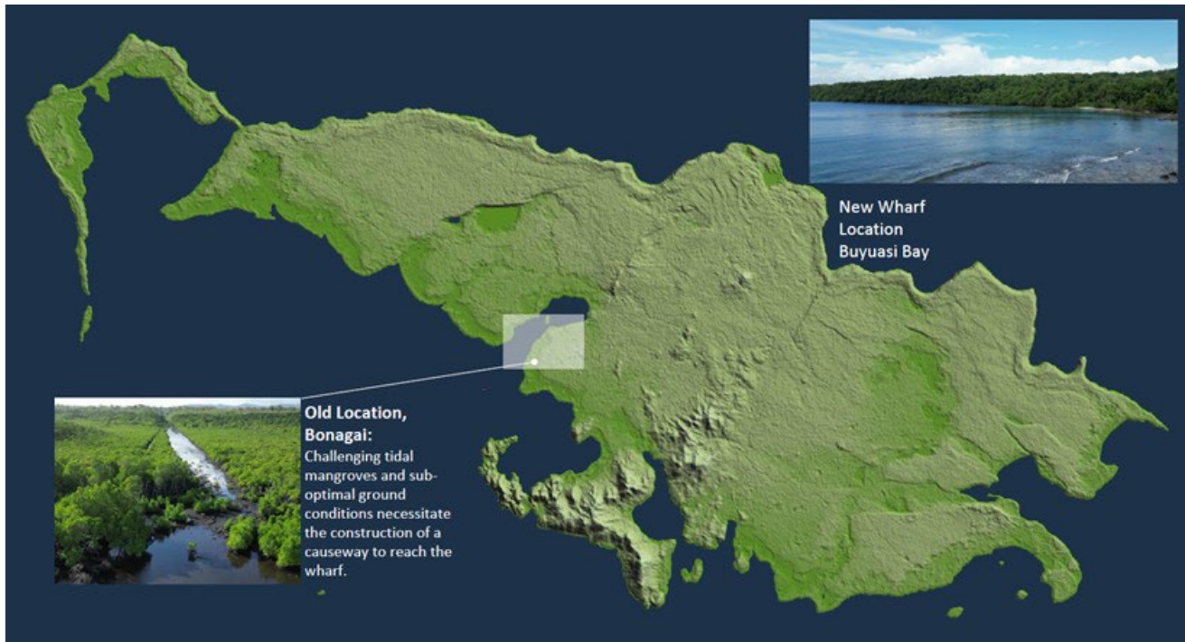
Old and proposed new wharf locations

The revised wharf location reduces the challenges associated with construction through the Bonagai mangroves and eliminates the requirement for a dedicated road out to the marine facility. Preliminary assessments of wave and bathymetry data support suitability of the wharf at Buyuasi Bay.