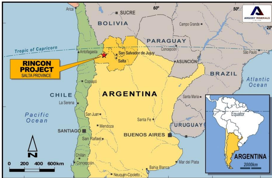
Argosy Minerals Limited – Rincon Lithium Project Location Map