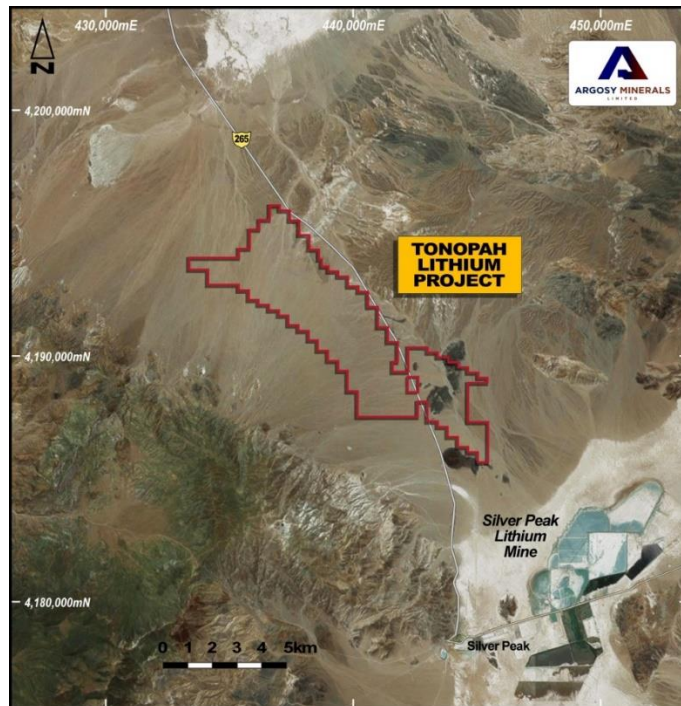
Argosy Minerals Limited – Tonopah Lithium Project Location Map

The Company has a 100% interest in the Tonopah Lithium Project (Tonopah), located in Nevada, USA and comprises 425 claims covering an area of ~34.25km 2 , and is strategically located near Albemarle's Silver Peak lithium carbonate operation in Nevada, USA.