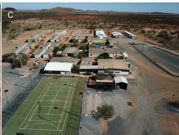
Figure 2: A. Schematic isometric long-section looking towards the north showing >2.7km of known mineralisation comprised of: Main Zone (~1Moz mined @ 1,000oz per vertical metre), under-drilled Eastern Zone, unmined Footwall Gabbro Zone and the Paulsens Repeat seismic target; 2B. Aerial view of Paulsens processing facility and site offices; and 2C. Paulsens village and camp.