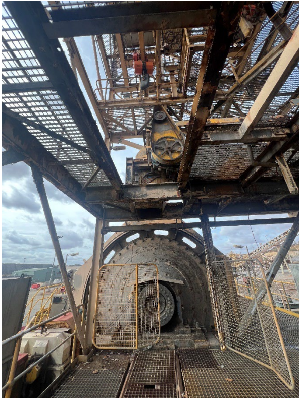
Figure 6 – Mill feed chute removed for rubber lining