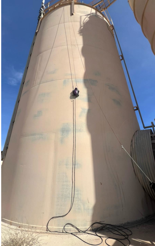
Figure 3- Thickness testing on the fine ore bin completed and showing better than anticipated results

Photographs from February 2024 refurbishment activities: