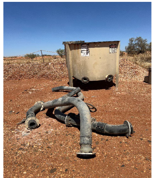
Figure 9 – Removed pre-leach thickener hopper to be re-lined