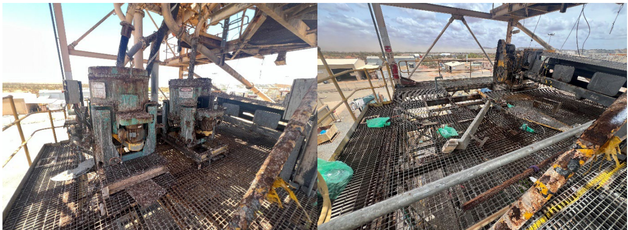
Figure 1 –Knelsons (x2) and associated pipework removed (before & after) facilitating the ready installation of the 2 new Knelson concentrators upon arrival.

Black Cat’s Managing Director, Gareth Solly, said: “Our refurbishment activity is progressing well with planned activity ahead of schedule and significant upside observed throughout the facility with lower than anticipated refurbishment required in certain areas.