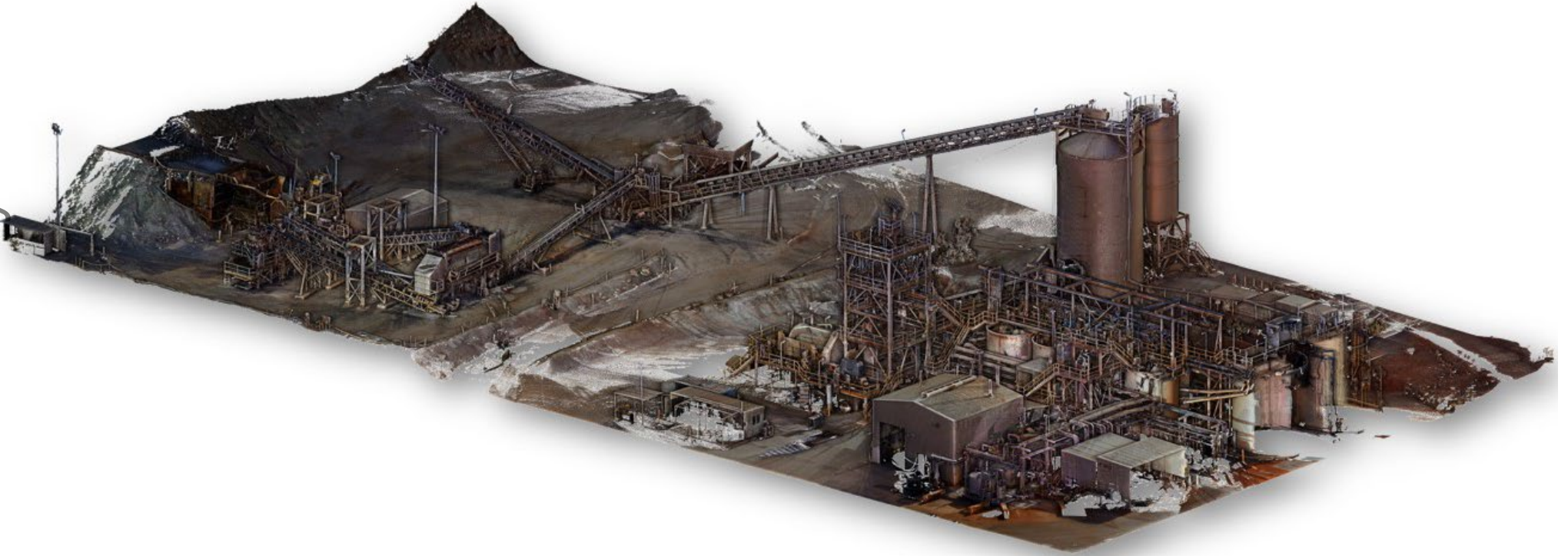
Figure 10: 3D scan of entire processing facility completed February 2024