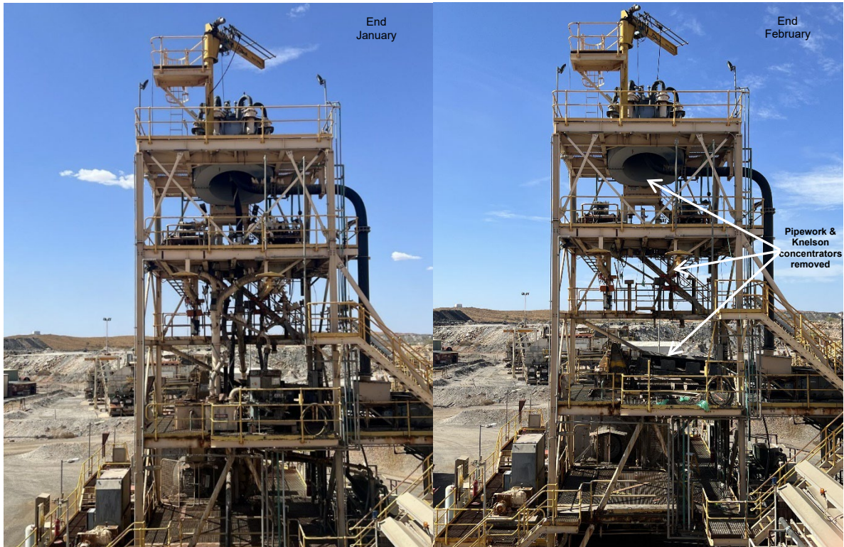
Figure 5 – Knelson concentrators along with cyclone underflow and mill feed pipework removed. Pipework will be rubber lined.