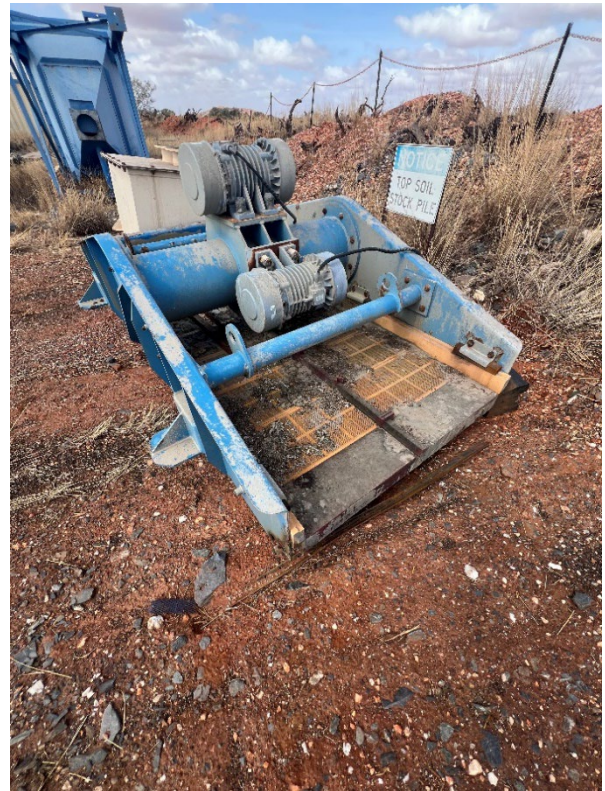
Figure 7 – Tailing Screen removed to replace the underpan