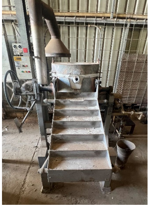
Figure 4 – Furnace replaced complete with new spout & crucible