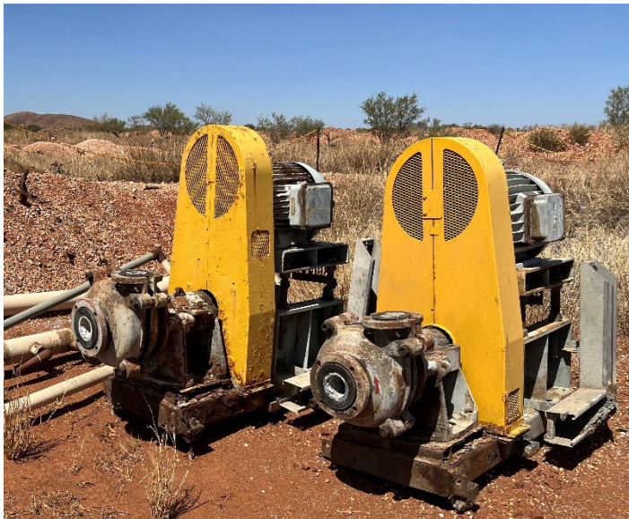
Figure 8 - Removed and successfully rebuilt process water pumps