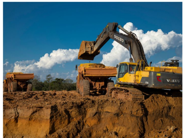
Photos: Lulo team setting up an auger drill rig (left) trial mining during resource definition work (right)