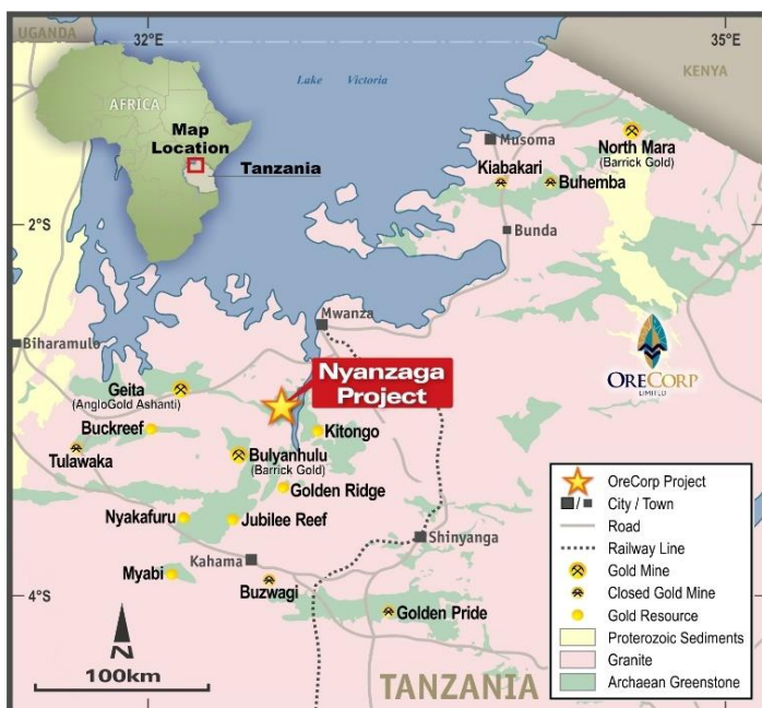
Figure 1: Lake Victoria Goldfields, Tanzania