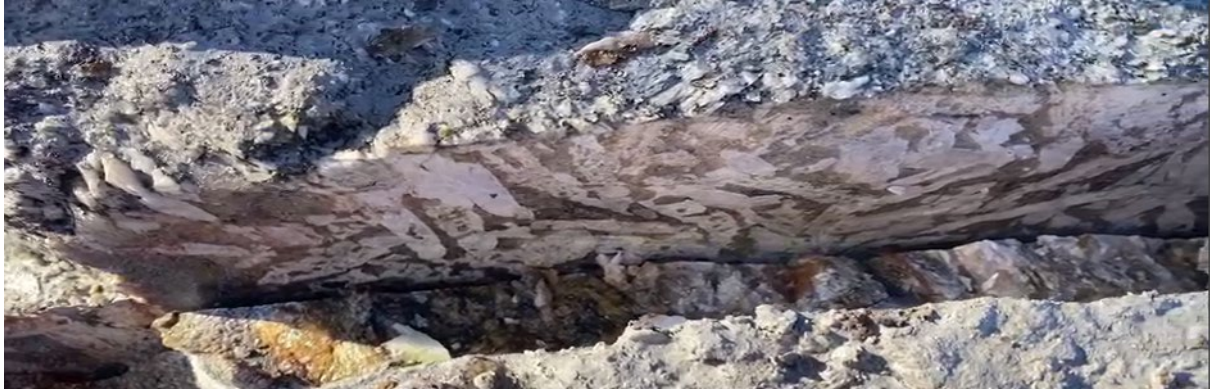
Photo of channel sample F0373658 and spodumene crystals at the Benham property