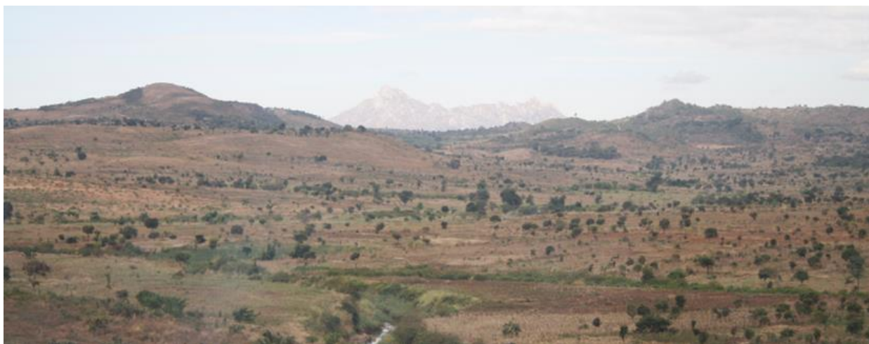
Figure 2: Looking East towards the Duwi Natural Graphite Project Site.