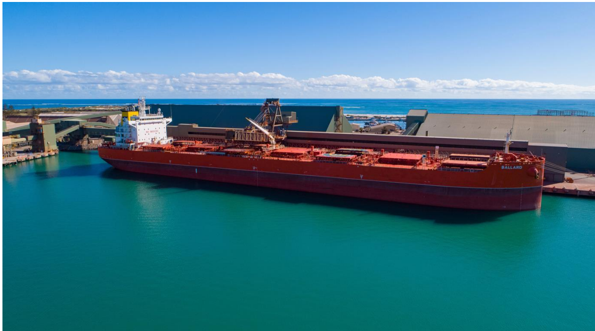
MV Ballard – Twin Peaks maiden shipment from Fenix's Geraldton Port facilities

Fenix Resources Limited (ASX:FEX) (Fenix or the Company) is pleased to announce that the first 59,275 tonnes of +60% Fe lump iron ore product ( Fenix TP Lump ) has been hauled, loaded and shipped from the high-grade Twin Peaks Direct Shipping Iron Ore Project ( Twin Peaks ).