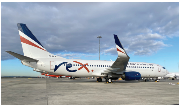
VH-8KH, the airline's eighth Boeing 737 arrived in Brisbane on 28 July 2023.