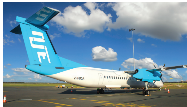
NJE's ninth Dash 8-400NG arrived in October 2023.