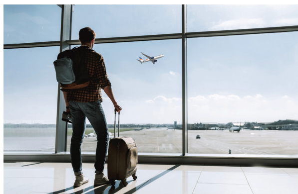
Rex launched its loyalty program, Rex Flyer on 2 October 2023.

Rex registered for the National Greenhouse Energy Reporting Act 2007 (NGER) programme in 2009 and has since submitted NGER reports since FY 2009. Rex submitted its 14th NGER report to the Clean Energy Regulator in October 2023.