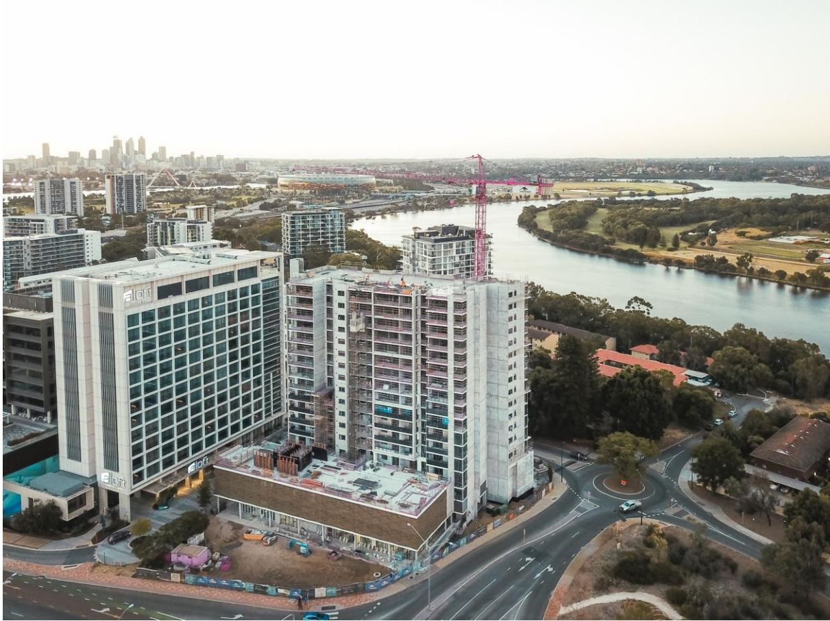
ABOVE: The Point (13/2/2024)