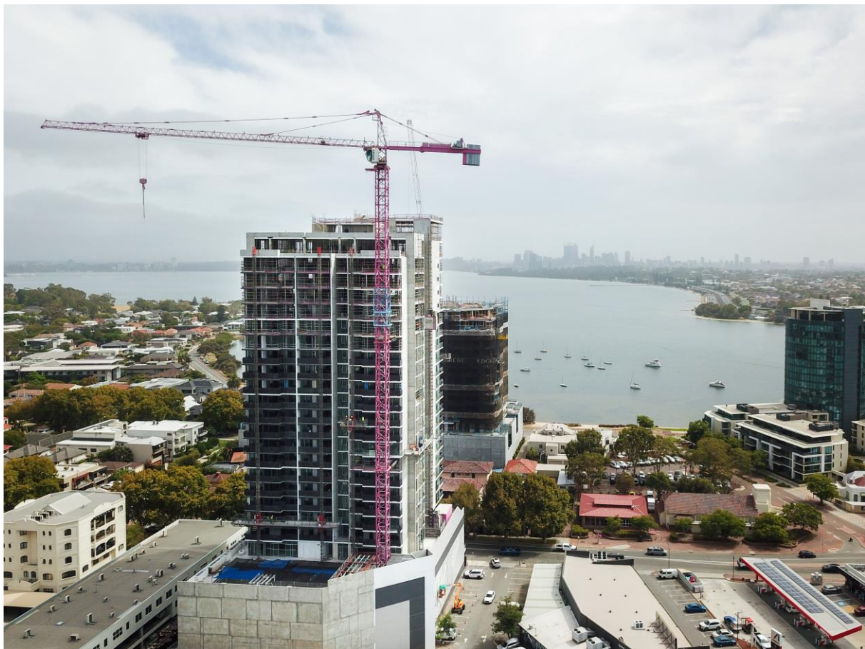
ABOVE: Aurora (15/2/2024)

Based on the current progress and expected completion timeline it is expected that practical completion of this building will not be reached until July 2024 with settlements forecast to commence in July/August 2024.