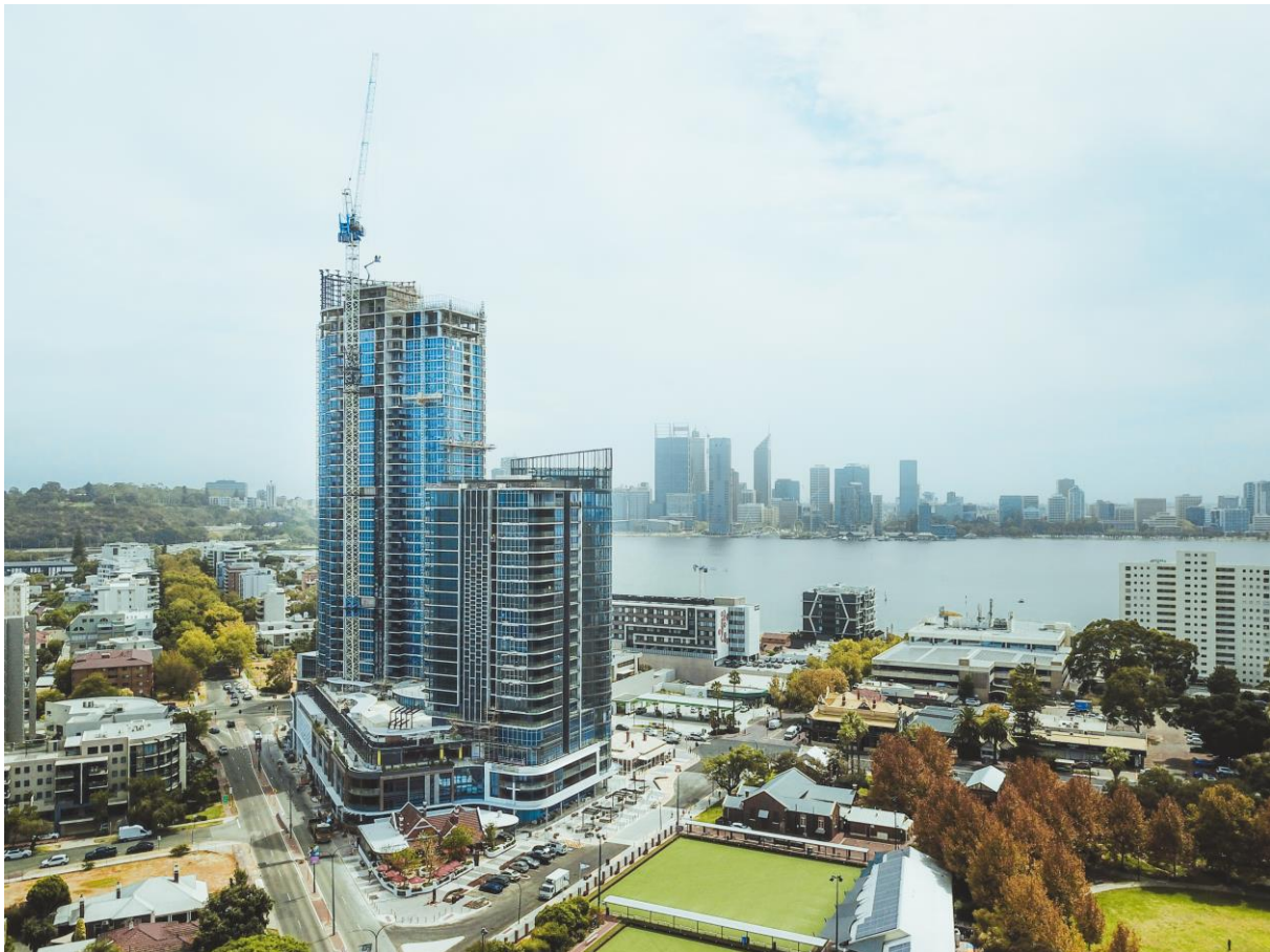
ABOVE: Civic Heart (15/2/2024)

It is anticipated that practical completion for this project will be reached in late May 2024 with settlements for the sold lots expected to commence in June 2024.