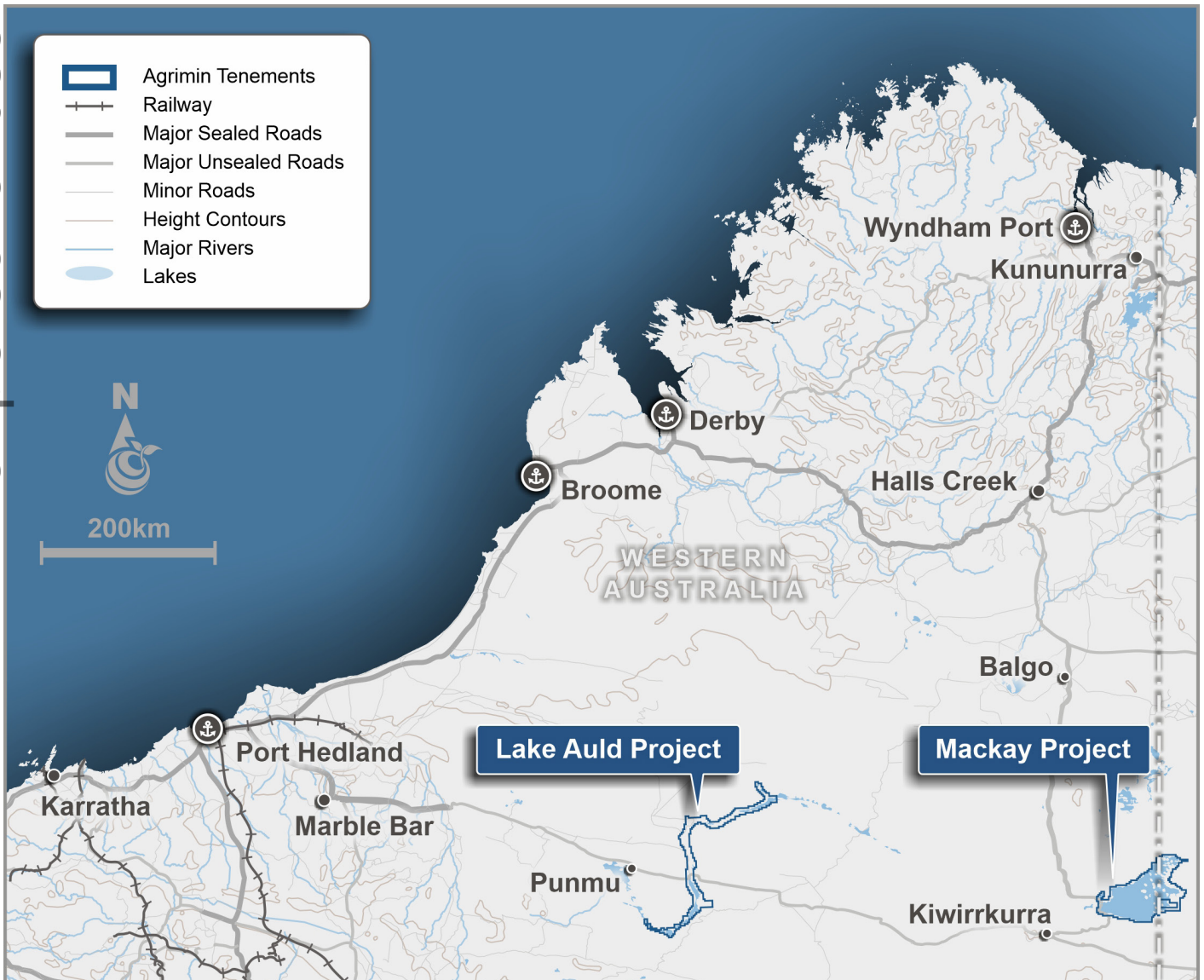
Figure 1: Map of Agrimin's Projects.