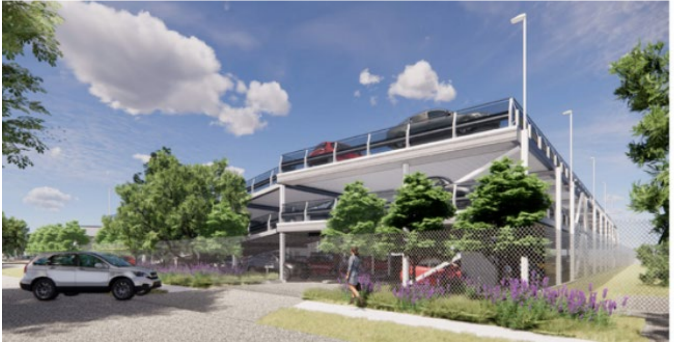
Image 2. Render of Development St from Forward St

This announcement has been approved for release by the Board of Directors.