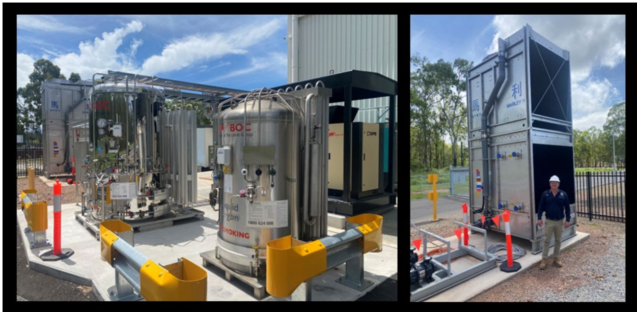
Support infrastructure for the synthetic sapphire growth units installed. Inert gas utilities (LHS) and water cooling tower (RHS)

The synthetic sapphire framing and furnace bodies have also arrived on site, with installation now underway.