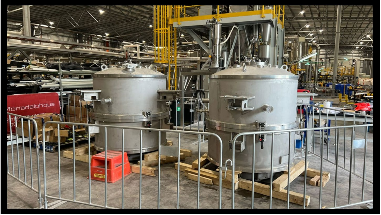
Sapphire grower shells, delivered and ready for installation