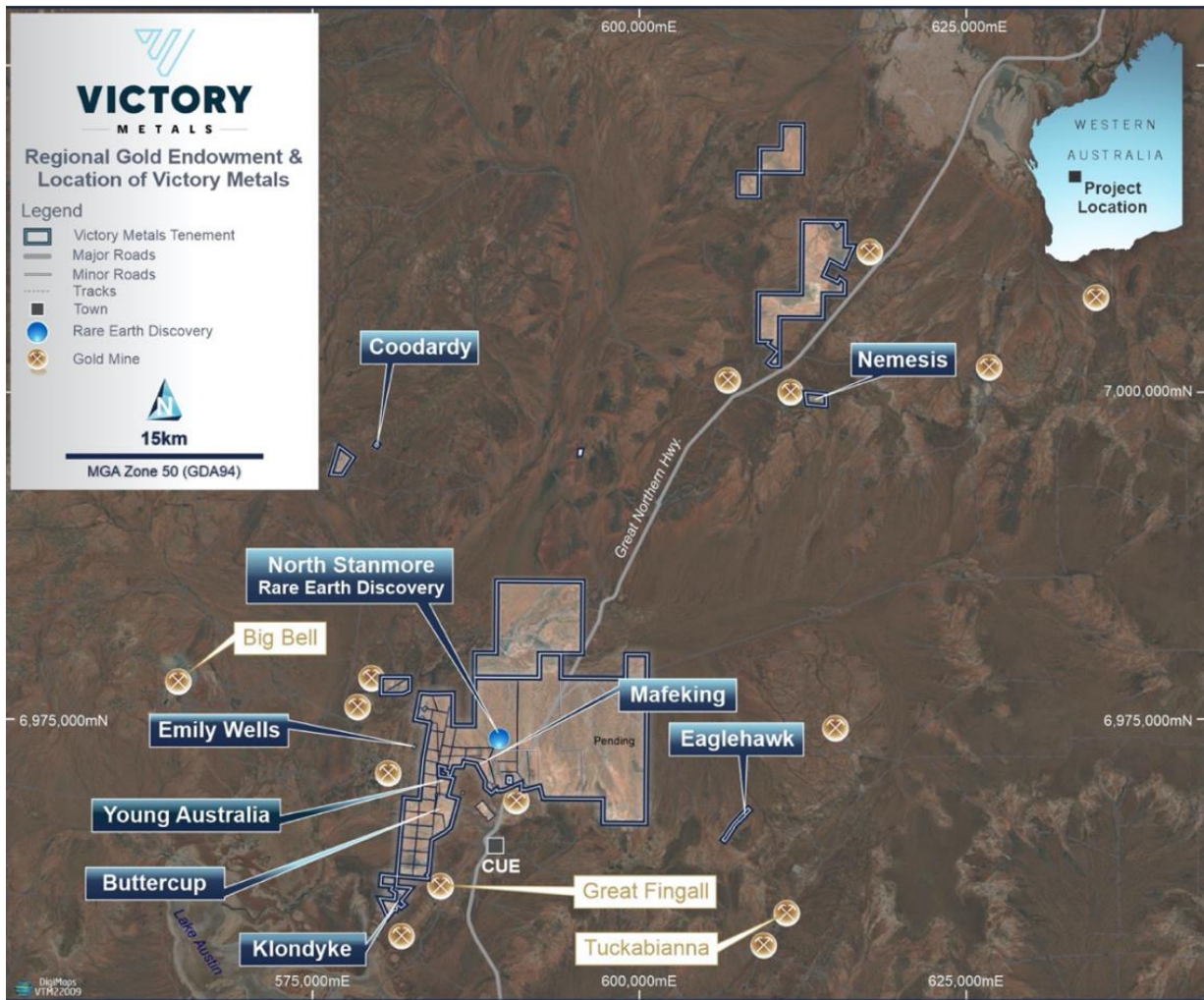
Figure 2. Regional Map showing Victory Metals tenement package and pending tenements.