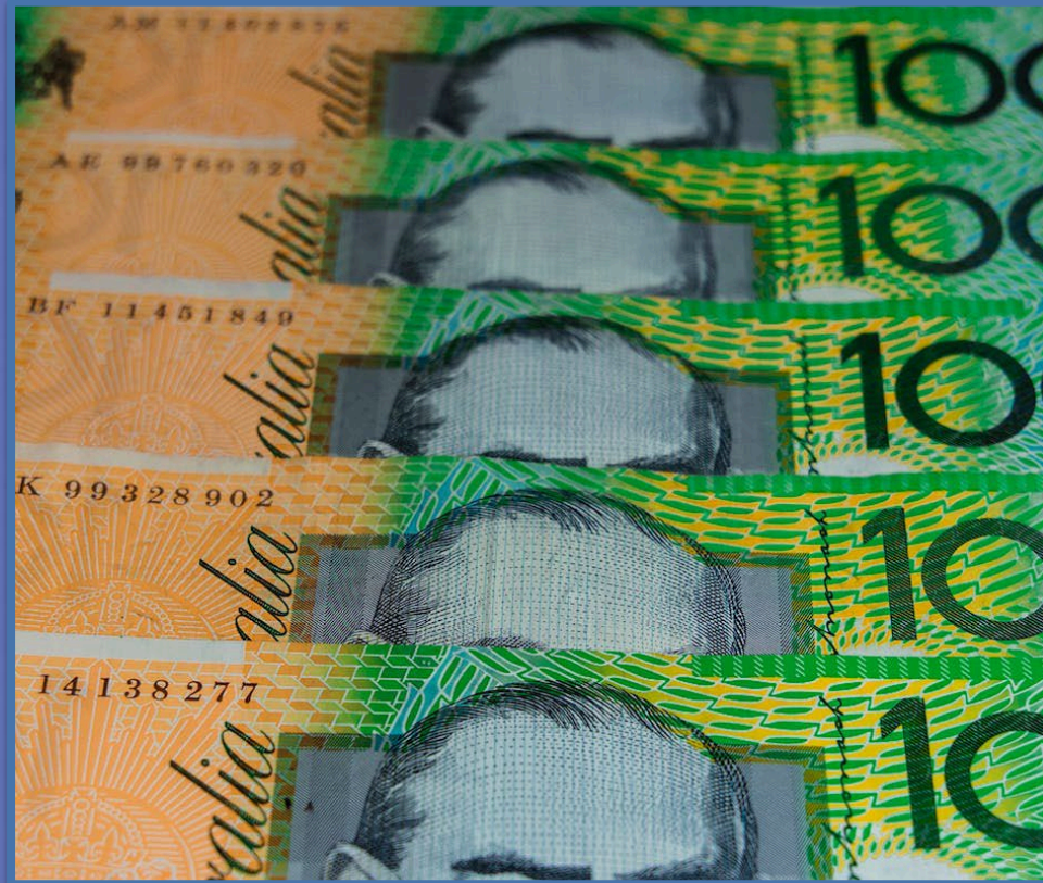
Quarterly revenue growth continues, culminating in strong FY revenues

Osteopore Limited (ASX:OSX) (“Osteopore” or the “Company”), a revenue-generating manufacturer of regenerative implants that empower natural tissue regeneration, is pleased to release its quarterly results and Appendix 4C Quarterly Cash Flow Report for the three months ending 31 December 2023.