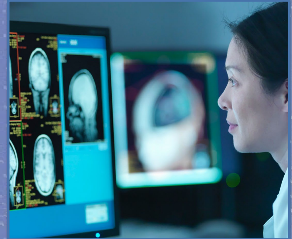
Strategic cost reduction initiative and internal realignment

Osteopore achieves milestone of 100,000 implants, ~80% achieved over the last 4 years (2019-2023)