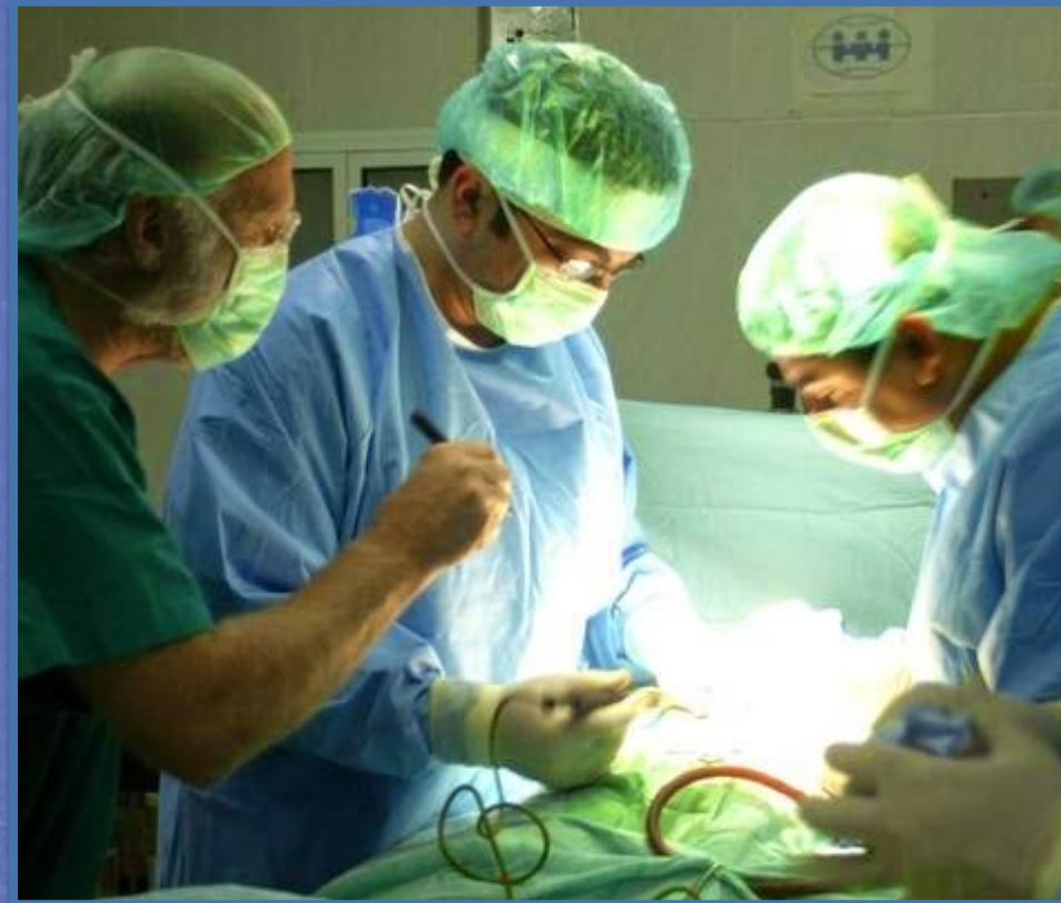
Osteopore achieves milestone of 100,000 implants

Osteopore’s revenue growth continues into Q4 CY23, culminating in record FY revenues of A$2,217,409 (S$1,978,476)