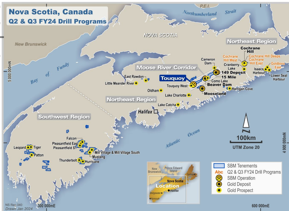
Figure 3. Q2 and Q3 FY24 Drill Programs, Nova Scotia, Canada