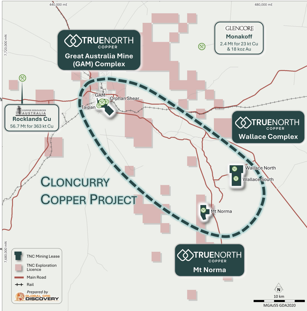
Figure 1. TNC's Cloncurry Copper Project.