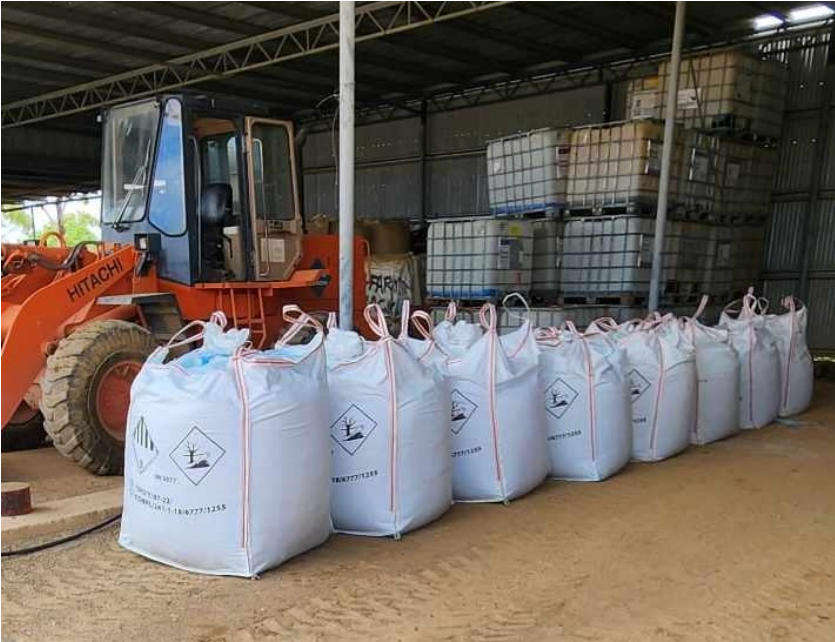
Bags of Copper Sulphate ready for shipment.