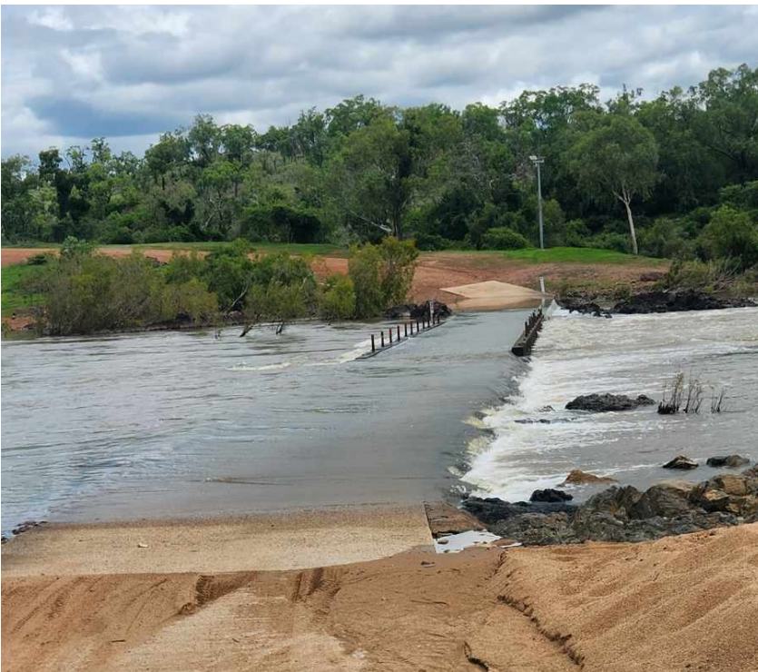
Walsh River crossing near Tartana Plant at 12 January 2024

This announcement has been approved by the Board of the Company.