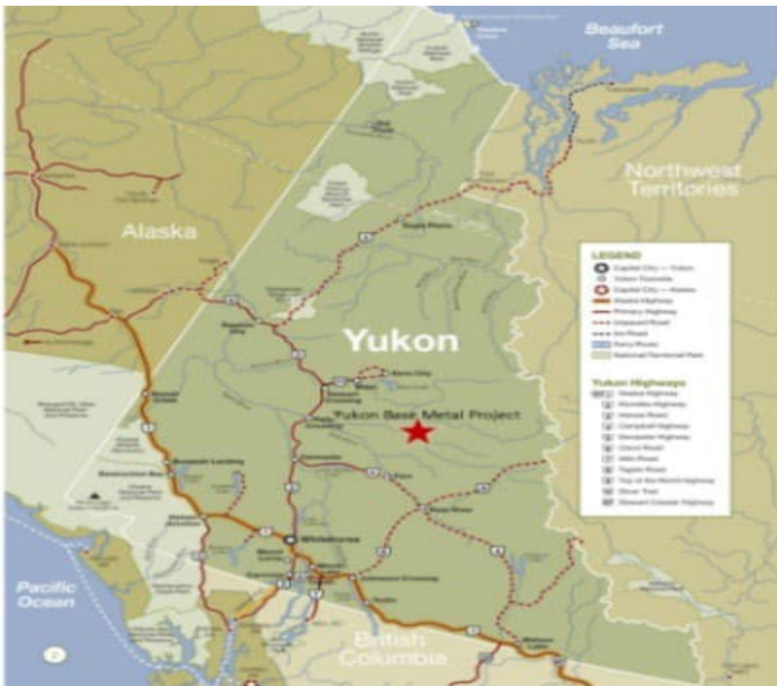
Figure 1. Yukon Base Metal Project location map

Renegade believes that there is potential to increase the resource base at the Yukon Base Metal Project. Mineralisation remains open at depth and along strike at the Andrew, Darcy and Darin Deposits.